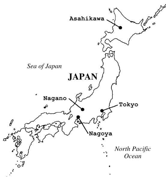
Figure 1 Sample sites in Japan

The 17 samples of the leaves were collected from 15 sites of Japan, including mountain areas, country site and city areas, for the last three years as shown in Figure 1. The leaves from the mountain areas were collected at Agematsu (35°45'N, 137°34'E, 1300 m above sea level) and Norikura (36°07'N, 137°08'E, 1450 m asl). The leaves from the country site were sampled at Asahikawa (43°46'N, 142°25'E, 130 m asl) in Hokkaido. The leaves from the city areas were gathered from Tokyo (35°N, 139°E, 20–60 m asl) and Nagoya (35°N, 137°E, 0–70 m asl). All samples are yearly-fallen leaves of the hardwood such as the Zelkova serrata and the Quercus variabilis .