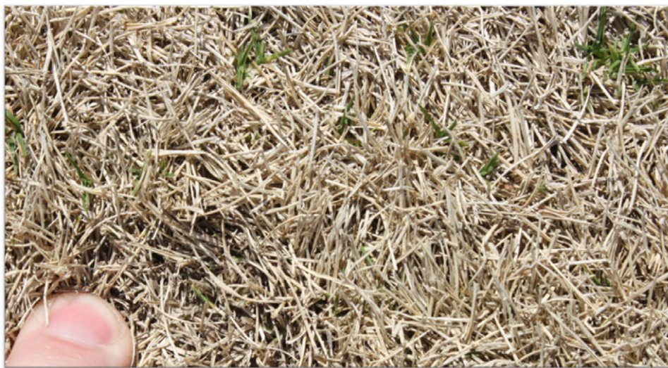
Figure 2. Herbicides were applied to 'Zeon' zoysiagrass with less than 20 subcanopy green or partially green leaves dm -2 and 0% visible green cover at application timing to evaluate the effect of annual bluegrass control products on annual bluegrass and dormant Zeon zoysiagrass.

c Methylated seed oil at 1% v/v and ammonium sulfate (100% soluble granule) at 1,680 g ha -1 were added to the treatment.