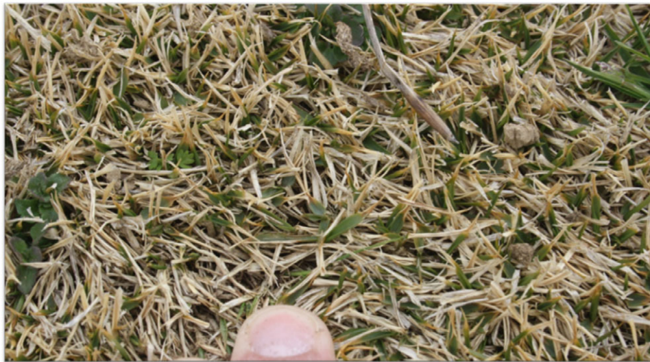
Figure 1. Herbicides were applied to 'Meyer' zoysiagrass with 5% ± 3% visual green zoysiagrass cover and 114 ± 30 green leaves dm -2 to assess the effect of broadleaf weed control products on weeds and semidormant Meyer zoysiagrass.

d Methylated seed oil at 1% v/v was added.