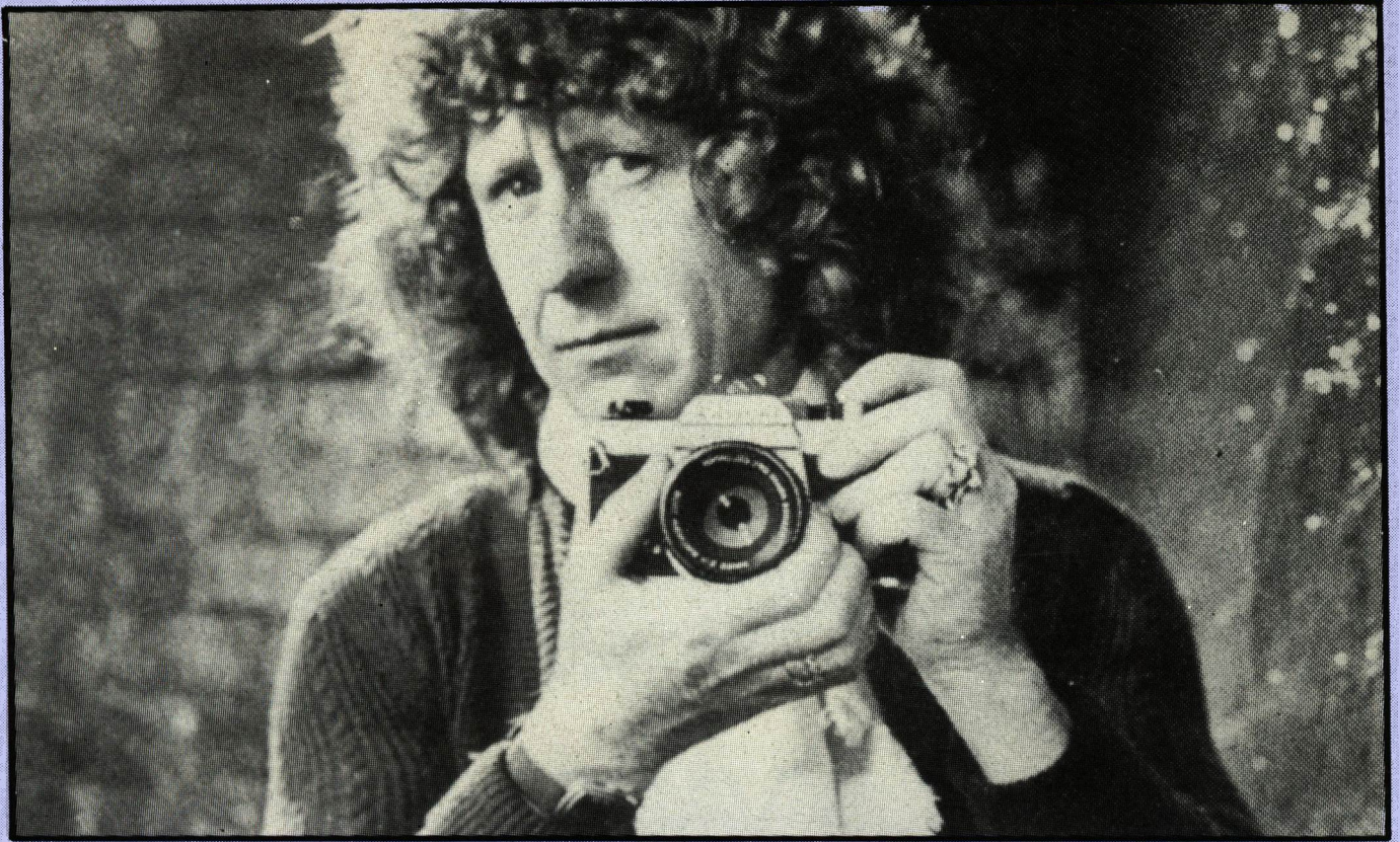
Top fashion and advertising photographer Peter Gough, reflecting on the new Pentax K1000.