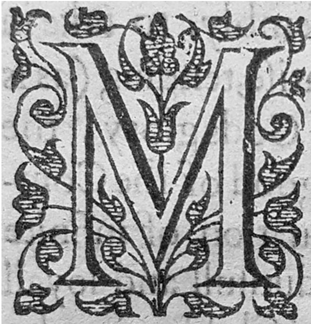
“Figure 5—Miles Smith, Sermons of the Right Reverend Father in God (London, 1632) [STC 22808], sig. F3r (36 × 36mm). © British Library Board, 4452.g.17.”