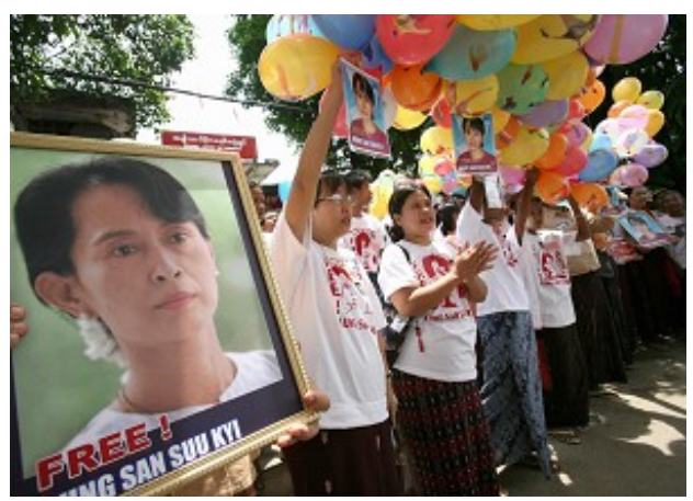
Members of National League for Democracy

In 2007, the pattern was remarkably similar. On August 19, a civil society group known as the "'88 Student Generation Group," veterans of the earlier protests, held a march with about 400 participants demanding that the SPDC rescind the fuel price hike.[6]