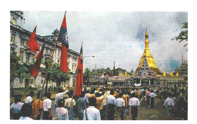
August 1988 protest, Sule Pagoda, Rangoon

That same month, following protests by university students, the universities were temporarily closed by the authorities and the students sent home.[4] But the economic impact of the demonetization order – the impoverishment of millions of people - was a major factor in the massive popular protests of 1988 that led to the emergence of the prodemocracy movement led by Daw Aung San Suu Kyi and the collapse of the Ne Win regime, though not an end to military rule.