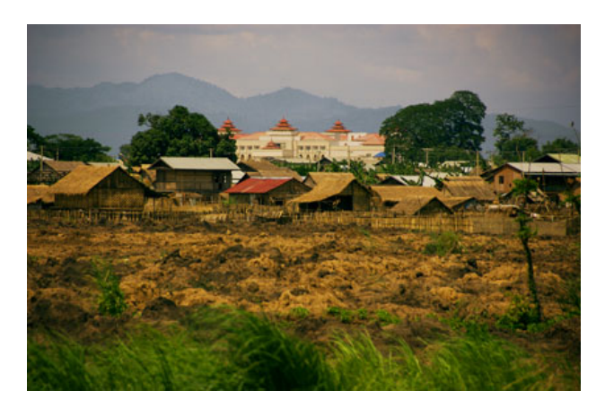
Naypyidaw government buildings overlook a shanty town

control.[26] Through an open economy policy encouraging foreign investment in condominiums, shopping centers, golf courses and luxury hotels, the regime sought to create the illusion, if not the reality, of consumerism and rising urban standards of living, making Rangoon appear increasingly like other Southeast Asian capitals, such as Bangkok and Kuala Lumpur.[27] But Burma's economy continued to stagnate, lurching from crisis to crisis such as the 2003 failure of the country's new commercial banks. Most importantly, the great majority of city residents (and rural Burmese as well) did not share in the benefits of the post-socialist economy. The SPDC abandonment of Rangoon in 2005 in favor of the ultra-controlled, artificial urban spaces of Naypyidaw 320 kilometers to the north thus constitutes the ultimate step in the "colonial" segregation of ruler and ruled.[28]