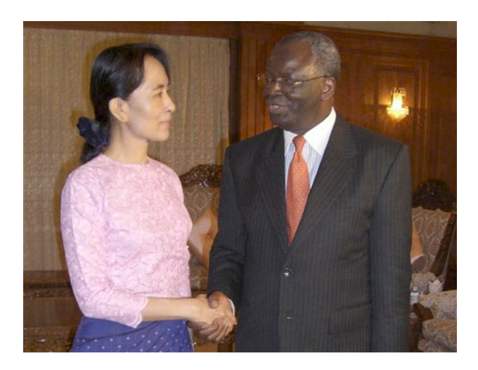
Aung San Suu Kyi with Ibrahim Gambari

The worst day appears to have been September 27, when the killing of peaceful demonstrators occurred at a high school in Tamwe in northeastern Rangoon, and around the Sule Pagoda.[12] As photos and videos of the crackdown streamed out of Burma on the World Wide Web, including those showing the apparent deliberate and close-range shooting of Japanese journalist Nagai Kenji by a soldier on September 27, international indignation grew and the special envoy of the United Nations Secretary General to Burma, Ibrahim Gambari, made a special visit to the country to meet with Aung San Suu Kyi and Senior General Than Shwe, chairman of the SPDC and the junta's most powerful general. But by the end of the month, the streets of Rangoon and other towns had been largely cleared of protesters, and the authorities were ruthlessly hunting down dissidents who had gone underground.[13]