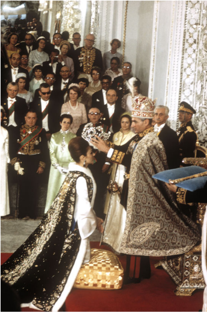
Figure 4. The crowning of Farah Pahlavi.

Queen Farah's crowning, however, was not presented as a comment on the evolution of the status of women in Iran, but on the wisdom of the shah for bestowing such an honor on his wife. Of the 1963 electoral law reforms, which granted women the right to vote, one official Iranian publication observed, "It was the shah and not the feminists who struck the next blow against inequality." 98 In other words, if Iran was to modernize, it had to rely on the throne, not political movements against social inequality. The enfranchisement of women was said to be "not only a humanitarian gesture but a brilliant political move. With the wind taken out of their sails of protest, women were forced into positive activity." 99 A similar point was made during the aforementioned special joint session of the senate and majlis to mark the beginning of the shah's twenty-fifth year on the throne, by Shukat Malik Jahanbani, one of the first women elected in September 1963 to the twenty-first Majlis. 100 Although the position of women had improved under the Pahlavis, she argued, real societal change only occurred after the direct intervention of the shah through the White Revolution: