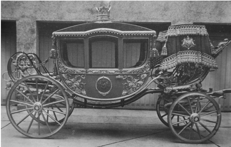
Figure 3. The coronation coach. From Krönung Seiner Majestät Mohammad Reza Schah Pahlawi Aryamehr Kaiser von Iran und Ihrer Majestät Schahbanou Farah Pahlawi Kaiserin von Iran (Vienna: Kaiserliche Iranische Botschaft, 1967).

similar to the Pahlavi crown? Second, “should it be Iranian in form, or not?” 90 The organizers opted for a more European design by the jeweler Van Cleef and Arpels, whose drawing was chosen out of fifty proposals submitted “by the greatest jewellers of the time.” 91 The crown was set with 36 emeralds, 34 rubies, 2 spinels, 105 pearls, and 1,469 diamonds from the crown treasury, and weighed close to 1.5 kilograms. 92 Queen Farah’s dress and cloak were designed and manufactured by Christian Dior, although the Iranian press was eager to stress that they had been sewn by an Iranian citizen. 93 Most of the materials for the dress and cloak were purchased from around the world, including velvet cloth produced by Bianchini in Paris, mink fur from Switzerland, and crystals from Austria. 94 The dress itself had a long train, which, like Queen Elizabeth II’s cloak in 1953 and that of Queen Elizabeth, the Queen Mother, in 1937, was carried by her attendants (Fig. 4).