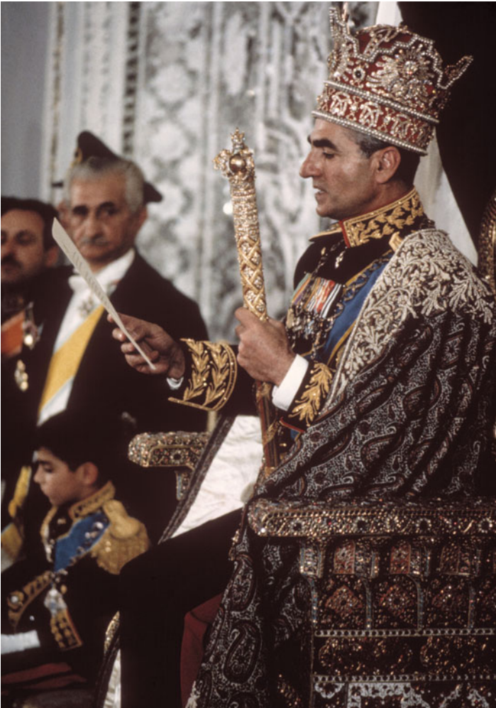
Figure 2. Mohammad Reza Pahlavi's speech from the throne.