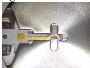
Figure 2. JEOL half grid high tilt retainer TEM sample holder