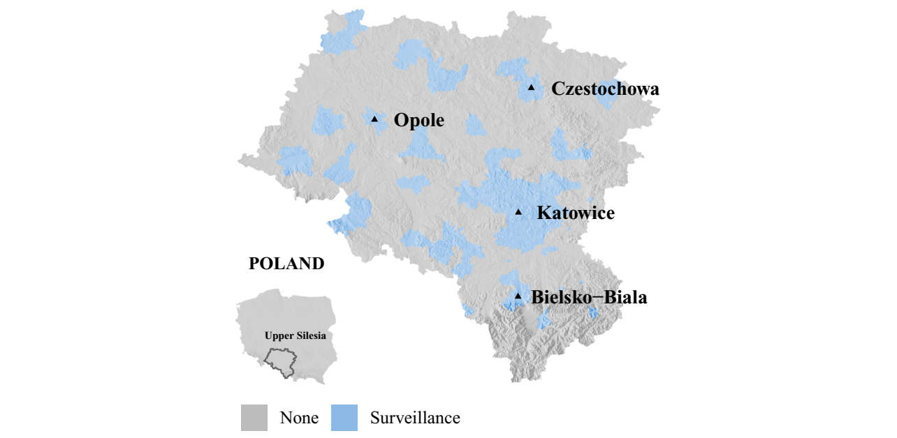
FIGURE 1. Surveillance in Upper Silesia

Note: The map shows all Upper Silesian municipalities exposed to any secret police officers between 1945 and 1989.