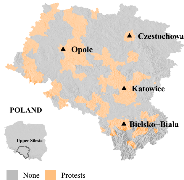
FIGURE 2. Protests in Upper Silesia

Note: The map shows all Upper Silesian municipalities where any Solidarność strike took place between 1980 and 1986.