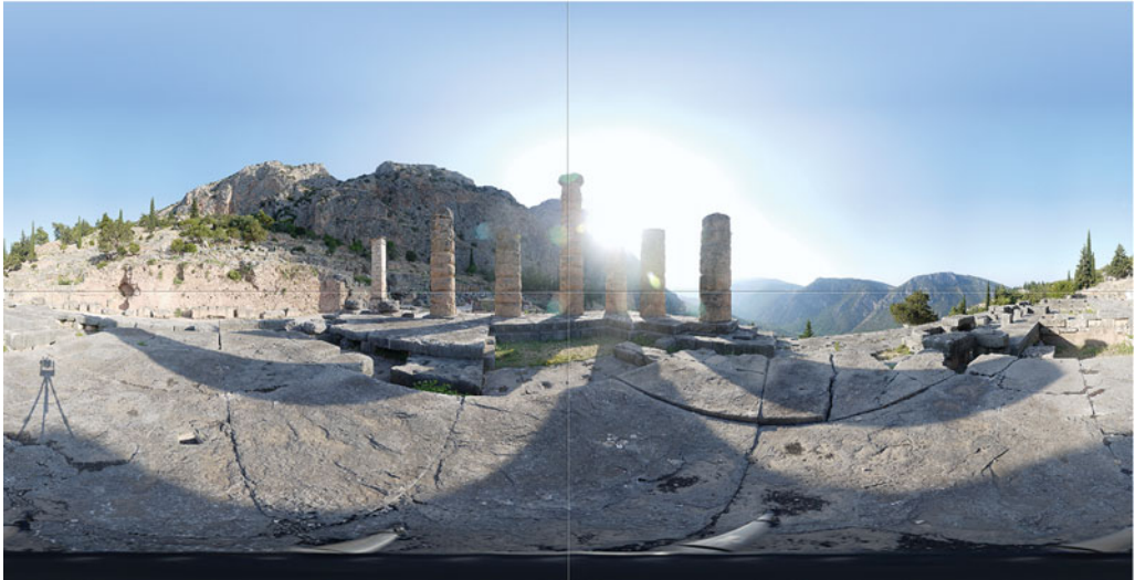
Figure 3. Stitched CAVEcam imagery from one camera of the Temple of Apollo.