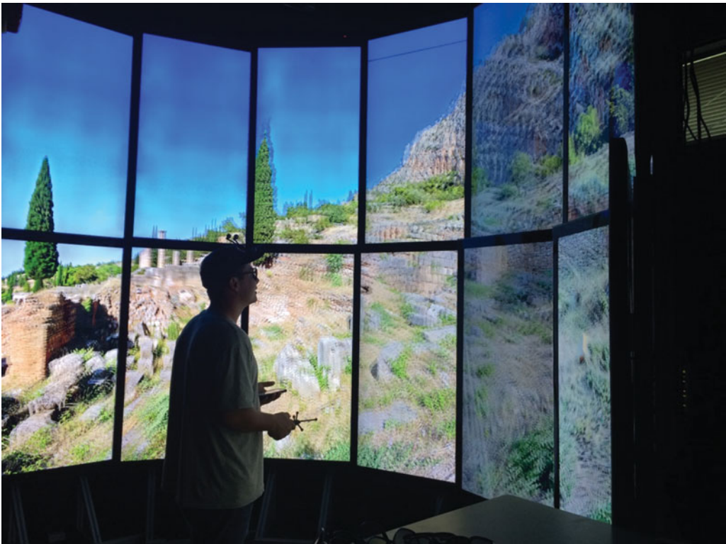
Figure 6. CAVEcam of Roman complex in the Qualcomm Institute, UCSD.