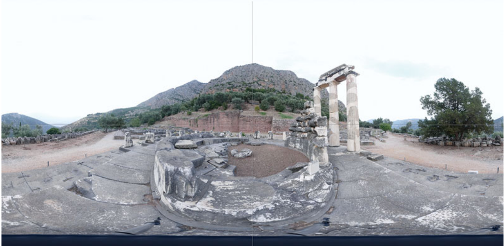
Figure 4. Stitched CAVEcam imagery from one camera of the interior of the Tholos.