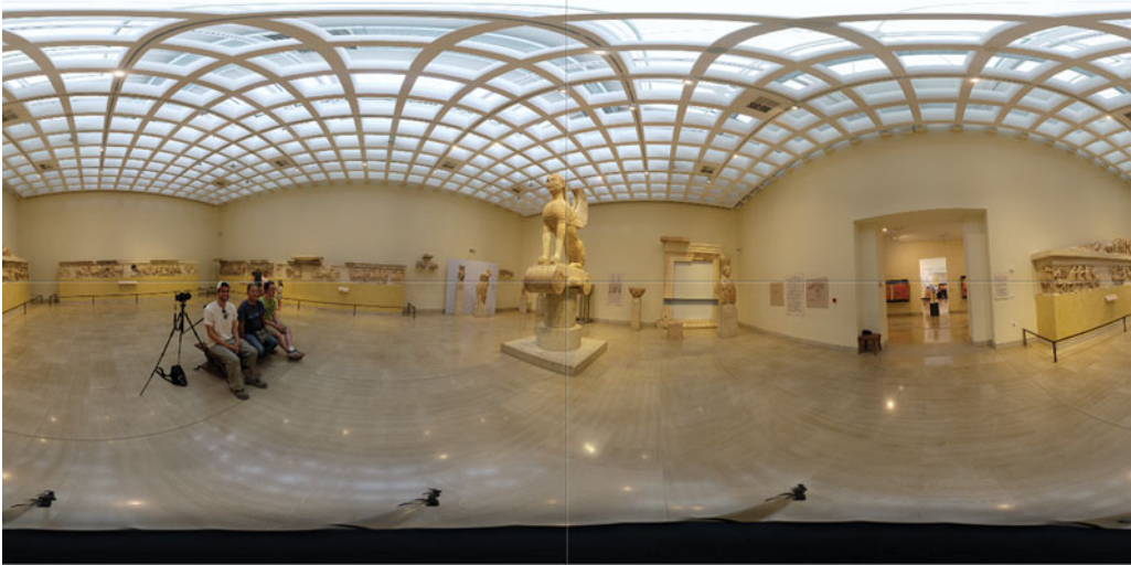
Figure 5. Stitched CAVEcam imagery from one camera of the Sphinx of Naxos.