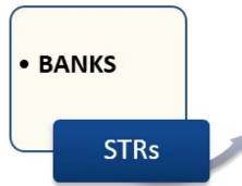
Figure 2. From bank to FIU.