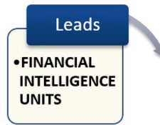
Figure 3. From FIU to police / prosecution.

possible connection to terrorism financing. In other words, Western Union translated the €326 transaction from regular digital record of a money transfer, to an ‘unusual’ transaction in the sense defined by Dutch money laundering law (Wwft). The law prescribes that the identification of unusual transactions should depend upon subjective indicators to be determined by the financial institution, instead of criteria prescribed by the regulator. Money transfers constitute the largest proportion of reports received by the Dutch Financial Intelligence Unit in recent years. 61