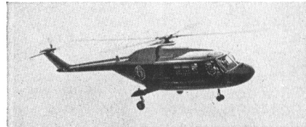
WG.13 French Navy