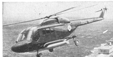
WG.13 Royal Navy