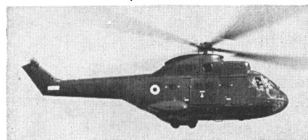
SA.330 French Army