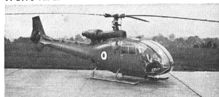
SA.341 French Army