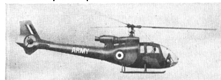
SA.341 British Army