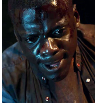
Figure 16 Chris's conflicted face just before he let's go of Rose's throat

illogical, (self-)destructive drive which is never fully explained. While Jo reproduces, to an extent, her ancestor Victor's madness, her drive for vengeance, power, and control of death is always couched in terms of her grief. Further, the series' consistent accounts of Jo's attempts to fight for progress through socially acceptable means only to continually confront systemic oppression clarify her determination to destroy the system that has tested her for too long. Her outlash signifies the "cleansing" conditions of violence 185 which Afropessimism defines as key for the Black theorist and Black theory if they are to truly disrupt systemic anti-Blackness and access full personhood. 186