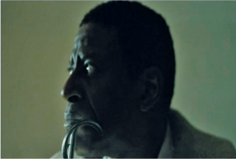
Figure 8 Sherman, frightened by the sound of approaching officers

intimidate Darryl while wearing a uniform that makes him look like an SS officer. 132 The uniform predicts the same craving for violence that Howard reveals in shooting Tommy's father. Later Rick reappears, 'amped up on imagination and anger when he turned the corner, his gun already drawn, looking for something to shoot'. 133 Invariably, Rick shoots Darryl in his own store, acting in a semi-official capacity as a local security guard. Rick's position is important given that he is not sanctioned by state or federal government to act in such a death-dealing capacity. The story, like other BLM Gothic texts, reminds us that, in a country of heavily-armed white citizens taught to devalue Black life, any individual can exercise violent anti-Blackness with a similar level of sanctioning. 134