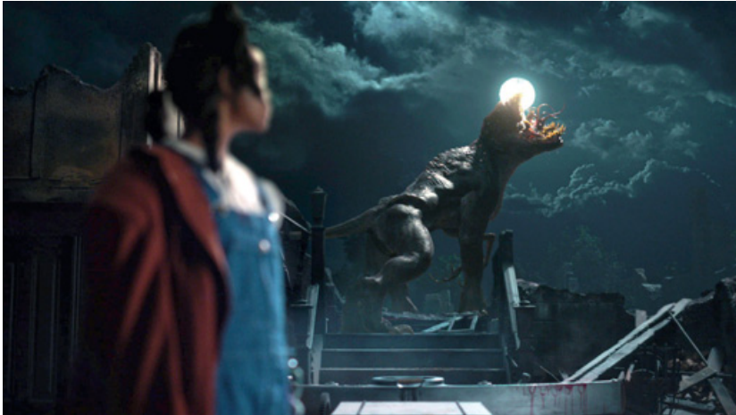
Figure 19 Dee, after killing Christina in Lovecraft Country

undergone a transformation that is the reverse of the Terminators. While over the course of several films, the Terminator becomes increasingly human, eventually sacrificing himself to protect humanity, Dee's new arm marks her as shifting towards the abhuman even as she too transforms in order to protect (Black) humanity.