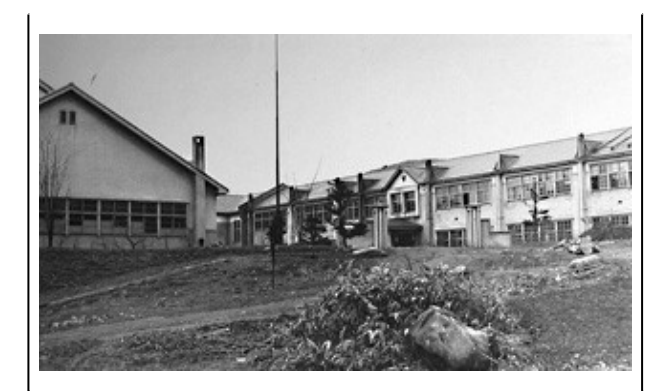
Utashinai High School, mid 1950s-1960s

At the end of vacation, I learned on the ferry back to Hakodate that there'd been a fire, and the house where I boarded had burnt down. I'd left most of my things there—the good suits, the bedding. Everything was gone. I announced that I was resigning and going back to Yoichi.