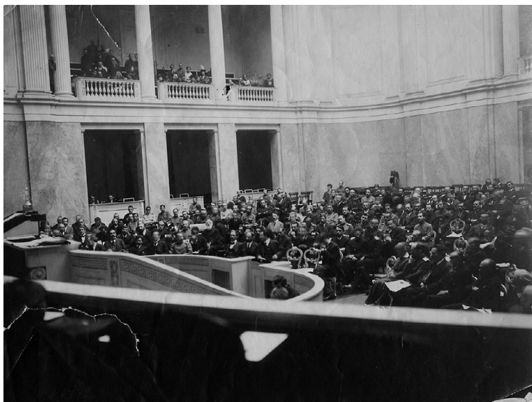
Figure 4. The Provisional Council of the Russian Republic in session, Petrograd, October 7, 1917.

Mensheviks, and the left side to the Bolsheviks (figure 4). Kerenskii opened the session when around one third of seats was still empty, and the Bolsheviks entered when he was already speaking. Avksent'ev was elected Chairman of the Presidium. 24