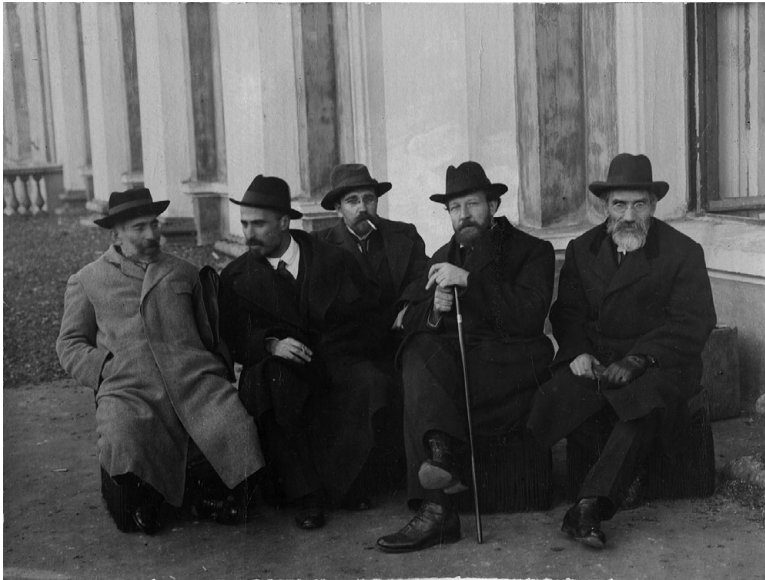
Figure 2. Members of the Presidium of the All-Russian Democratic Conference, Petrograd, September 1917. Left to right: N. S. Chkheidze, I. G. Tsereteli, L. B. Kamenev, N. D. Avksent'ev, and G. I. Shreider.

of workers' and soldiers' deputies and trade unions were predominantly against a coalition; those of cooperatives and zemstvos were predominately in favor. Peasant soviet , military, and municipal groups split almost evenly. Yet most delegates rejected those who were implicated in the Kornilov Affair and the KD Party as a whole as possible coalition partners in two subsequent votes. After this, the issue of coalition was again put to vote and rejected with 813 votes to 183 and 80 abstaining. The Conference, however, did not resolve to form a "uniform" socialist government either. Instead, the Presidium proposed discussing the issue in a smaller meeting of representatives of all "curial" groups and political "currents," which the Conference approved. 12