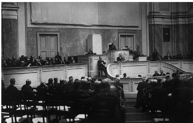
Figure 5. War Minister A. I. Verkhovskii speaking in the Provisional Council of the Russian Republic, October [10], 1917. N. D. Avksent'ev is chairing; A. F. Kerenskii is seated on the left side first from the right.