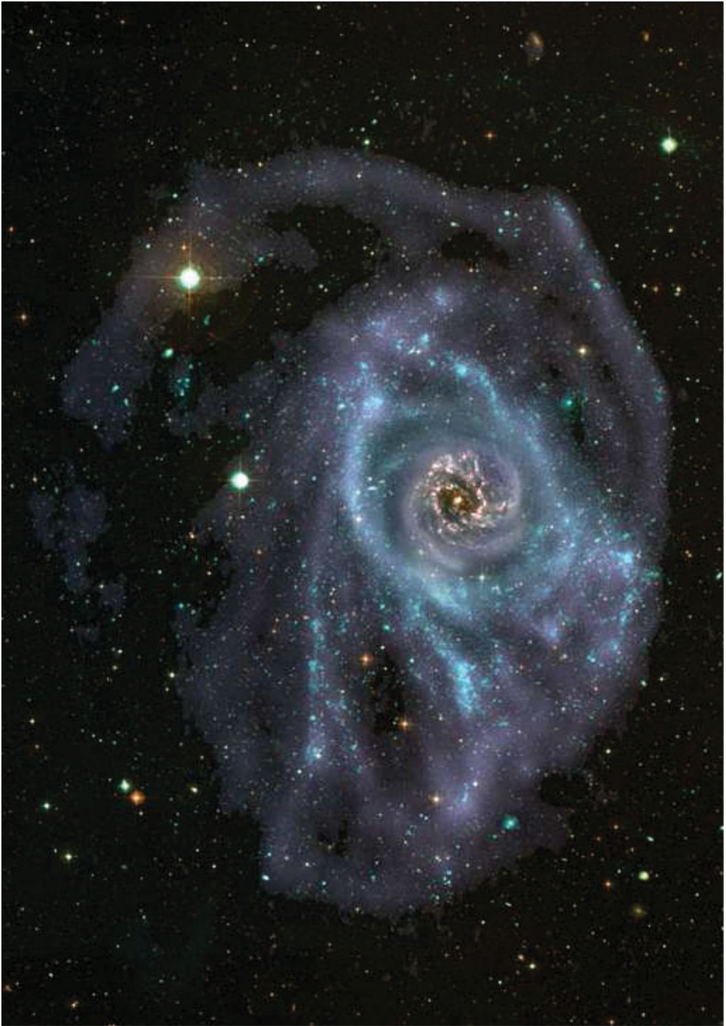
Figure 3. Multi-wavelength image of the spiral galaxy M 83. The large neutral hydrogen (H I) disk, shown in blue, was mapped with the ATCA and extends well beyond the stellar disk. For the color composition we also used GALEX NUV+FUV (light blue), DSS R -band (green), and 2MASS J -band (red) images. (Image credit: Ángel R. López-Sánchez).