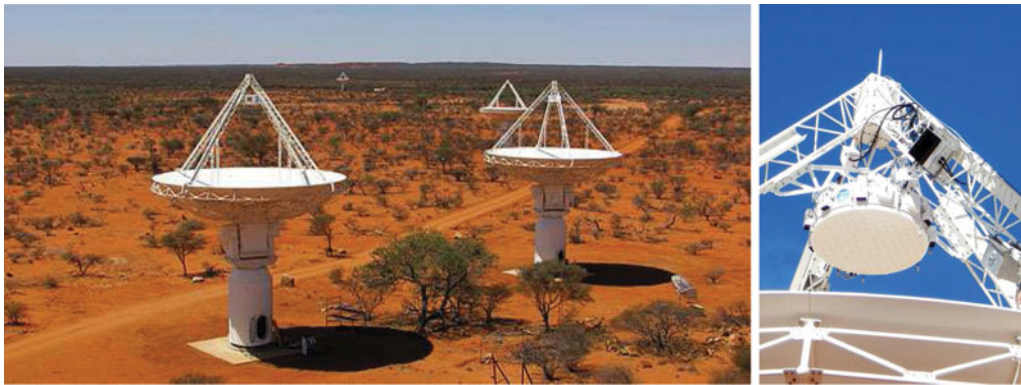
Figure 4. — (Left) Three of the 36 ASKAP antennas at the Murchison Radio astronomy observatory (MRO) in Western Australia. — (Right) The first Mk II PAF was installed on ASKAP antenna 29 in September 2014. (Image credits: Ant Schinckel, CSIRO).

For comparison, the H I disk of the Circinus galaxy has a diameter of \sim 80' or \sim 100 kpc at an adopted distance of 4.2 Mpc (For, Koribalski & Jarrett 2012), \sim 5\times larger than the extrapolated Holmberg diameter of \sim 17' (Freeman et al. 1977).