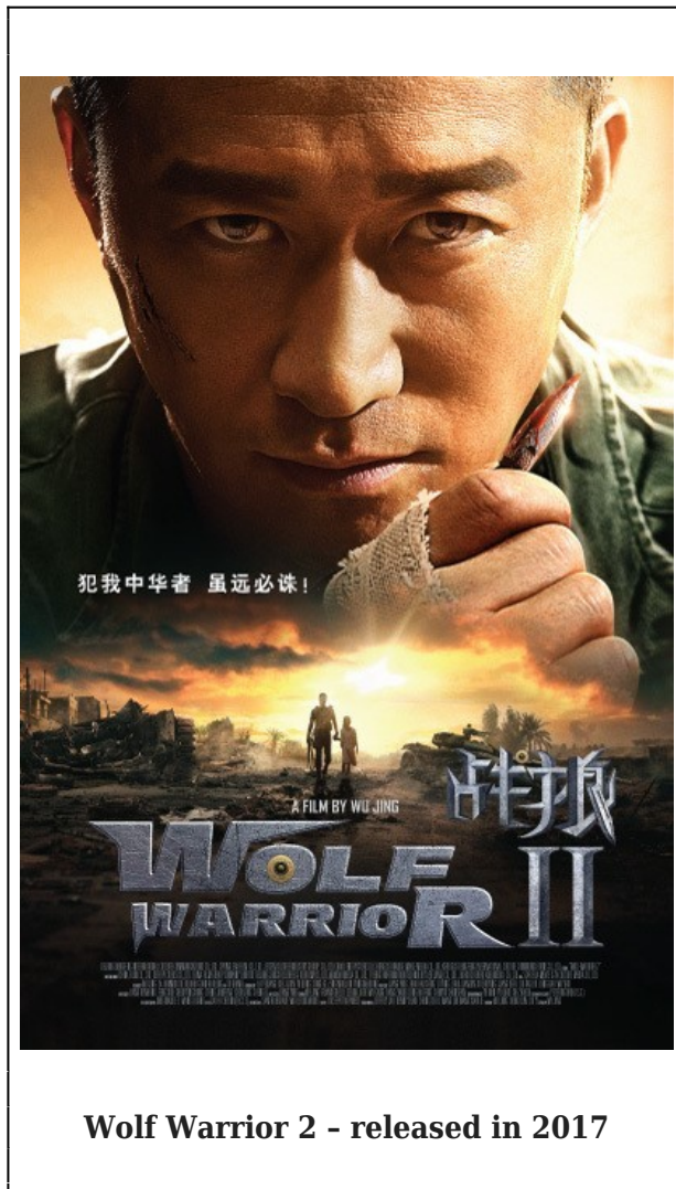
Wolf Warrior 2 - released in 2017

administered on him by Dr. Smith. Although his heroic acts seem to outstrip his original motivation of vengeance, Feng's desire to avenge his fiancée's murder still surfaces when he pursues Big Daddy (played by American actor Frank Grillo), the antagonist, even as he (Big Daddy) retreats following missile attacks on the rebels by a Chinese Navy ship.