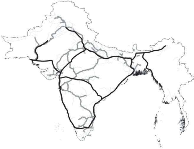
FIGURE 3 MAP OF 1852 KENNEDY PLAN

Notes: 1852 Kennedy Plan drawn in black. 1881 railway network drawn in grey. Source: See text for details.