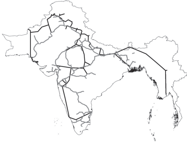
FIGURE 2 MAP OF MILITARY CANTONMENT SPANNING TREE

Notes: Spanning tree drawn in black. 1881 railway network drawn in grey.