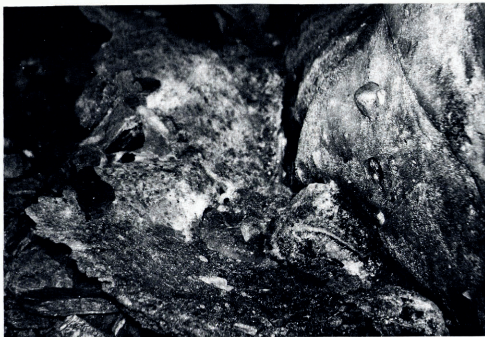
Fig. 2. Basal ice (right) deforming between the floor and the over-riding glacier. Ice formed by refreezing of water on the floor of the subglacial cavity (centre) itself is deforming in contact with basal glacier ice. Note the rock particles being expelled from the deforming ice, and the fracture plane (top right).

The creep-rate of ice at or very close to the bed is likely to be influenced by the amount, nature, and distribution of small sediment particles within it. Whilst the degree of deformation of very dirty, fine-grained, bubble-free ice is much lower than that of clean ice subject to the same stress (Hooke and others, 1972), ice with a sand content of 3% or less by volume apparently deforms more readily than does clean ice (Goughnour and Andersland, 1968). At the western margin of the Greenland ice sheet in the Thule area, fine material evenly