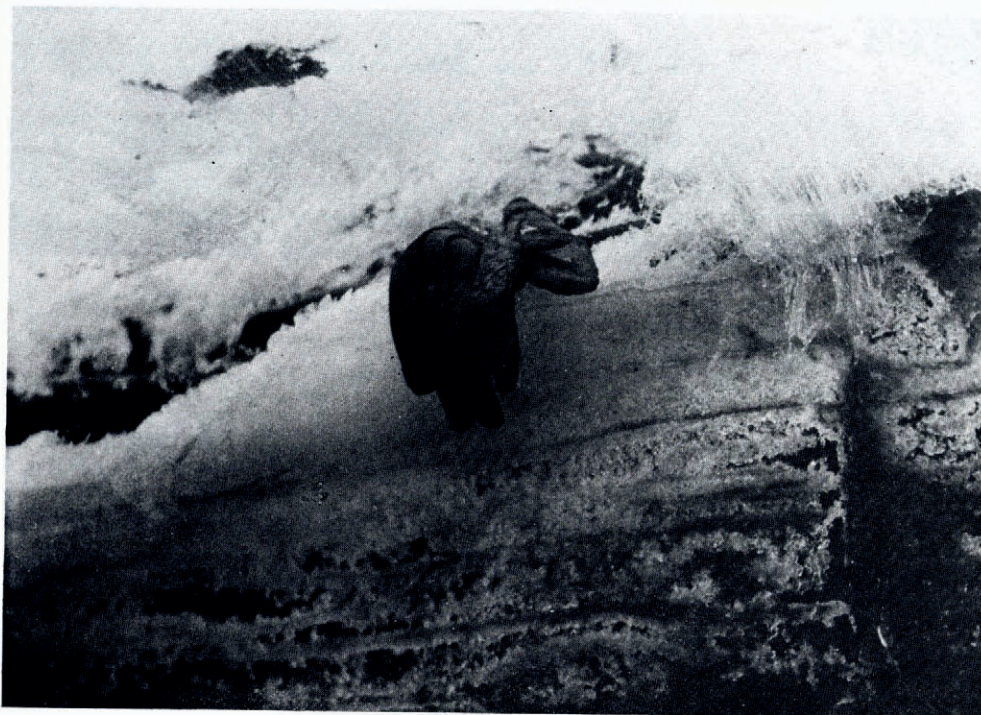
Fig. 3. Regelation spicules (top right) peeling from the glacier bottom at the ceiling of a subglacial cavity. Much of the upper part of the vertical rock cliff which forms the up-glacier limit of the cavity (bottom) is ice-coated. The glove marks the line along which the sliding glacier base (top left) loses contact with the bed.

Various forms of ice resulting from refreezing of melt water exist in subglacial cavities at Østerdalsisen. Where the ice/rock contact is broken abruptly at the up-glacier limit of cavities, the under surface of the glacier may bear needle-like regelation spicules (Fig. 3). The spicules, which at Østerdalsisen are 1.5–3 mm in diameter and up to 12 cm long, generally are aligned in the direction of glacier sliding, although some have a less regular arrangement. They lengthen as sliding continues but eventually deform slowly, their outer ends peeling away from the glacier bottom (Fig. 3).