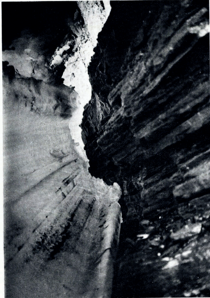
Fig. 1. View up-glacier of ice at the bottom of Østerdalsisen moulded by the form of the rock surface (right) past which it has moved.

for fracture to occur but, on remaking contact with the bed at the down-stream end of the cavities, the ice may once more deform under stress. Highly stressed basal ice at such sites beneath Østerdalsisen tends to creep into large cavities, rotating as a result of the relative orientation of bed slope and ice-flow direction (Theakstone, 1966). The degree of deformation varies considerably from place to place beneath the glacier, reflecting local differences of conditions at the bed and marked departures from the mean stress.