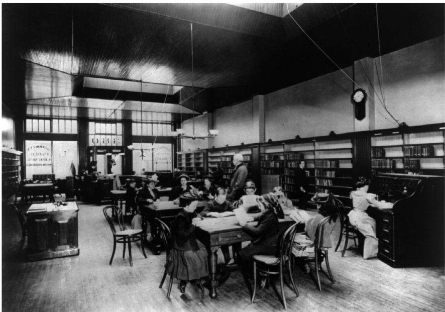
Figure 3. As a child, Betty Smith frequented this Williamsburg, Brooklyn, branch of the public library, shown here in 1904. It served as the model for Francie Nolan’s beloved library.