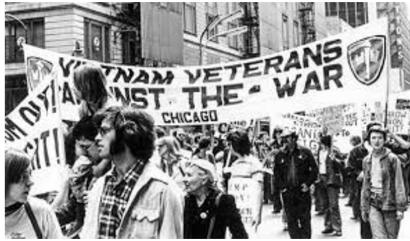
Marching Against the War: Vietnam Veterans Against the War

In the same speech, Agnew said the antiwar vets “didn’t resemble” the veterans “you and I have known,” a statement, when combined with having gay-baited them, was a effort to draw an “us and them” distinction, a discourse that anthropologists would characterize as “otherizing.” Thusly drawn, the line invited more pronounced differentiations between “real men” and those who now refused to fight.