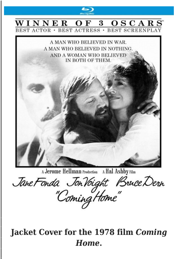
Jacket Cover for the 1978 film Coming Home .

The shift from the political discourse that had dominated the veterans' homecoming story in the late 1960s and early 1970s to the mental-health discourse that became dominant in the 1980s is evinced in Hollywood film. In the 1978 film Coming Home Luke (Jon Voigt) is politicized by his experience in Vietnam and shoddy treatment at a military hospital; he comes out publicly against the war. Four years later we're given Rambo (Sylvester Stallone) who suffers flashbacks to his combat experience in the opening scene of First Blood , and then goes on a murderous rampage. Although political veterans like Luke were never prominent in feature films, the die was cast with Rambo—from then on, American film-goers got a regular diet of warriors home with hurts.