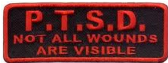
Shoulder Patch Capturing the Paranoia about "Hidden" War-wounds.