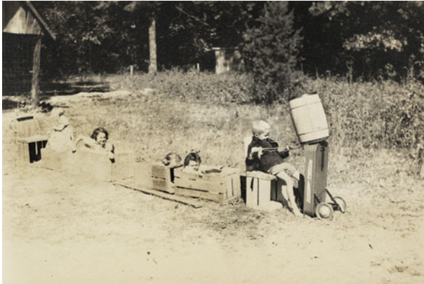
Figure 1. A group of Highlander Nursery School children making a train with wooden crates.