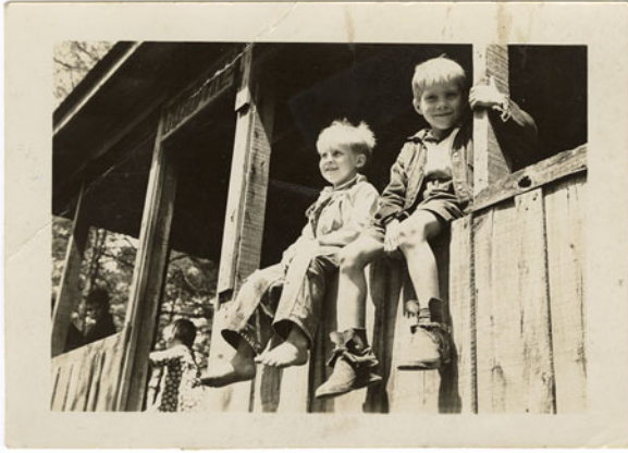
Figure 3. Two children on the porch of the nursery school, 1930s.