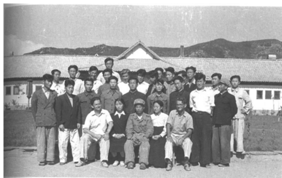
Korean and German workers in the Hamhung reconstruction project, late 1950s.

promise given by you, dear comrade Prime Minister, to our delegation at the Geneva Conference, to rebuild one of the destroyed towns by the efforts of the German Democratic Republic...The government of our Republic has decided as the object of reconstruction and recovery by your government the city of Hamhŭng, one of the provincial centers of our Republic. 13