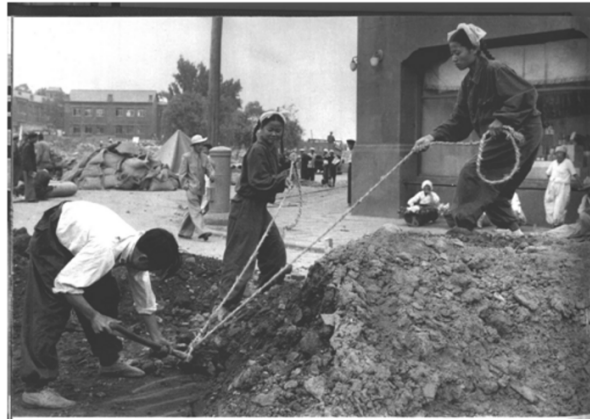
Rebuilding Pyongyang. From Chris Marker, Coreennes (Paris: Seuil, 1959).

would require all the work and resources the North Korean people could muster.