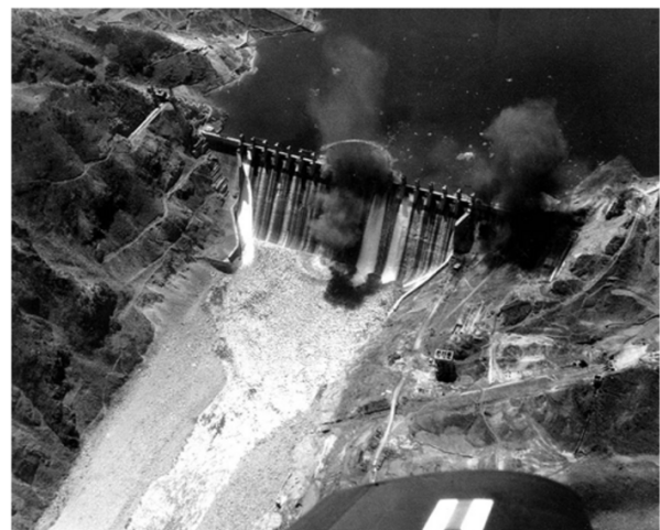
Aerial bombardment of Hwachon Dam.

1950 and 1951. To escape the bombing, entire factories were moved underground, along with schools, hospitals, government offices, and much of the population. Agriculture was devastated, and famine loomed. Peasants hid underground during the day and came out to farm at night. Destruction of livestock, shortages of seed, farm tools, and fertilizer, and loss of manpower reduced agricultural production to the level of bare subsistence at best. The Nodong Sinmun newspaper referred to 1951 as "the year of unbearable trials," a phrase revived in the famine years of the 1990s. 9 Worse was yet to come. By the fall of 1952, there were no effective targets left for US planes to hit. Every significant town, city and industrial area in North Korea had already been bombed. In the spring of 1953, the Air Force targeted irrigation dams on the Yalu River, both to destroy the North Korean rice crop and to pressure the Chinese, who would have to supply more food aid to the North. Five reservoirs were hit, flooding thousands of acres of farmland, inundating whole towns and laying waste to the essential food source for millions of North Koreans. 10 Only emergency assistance from China, the USSR, and other socialist countries prevented widespread famine.