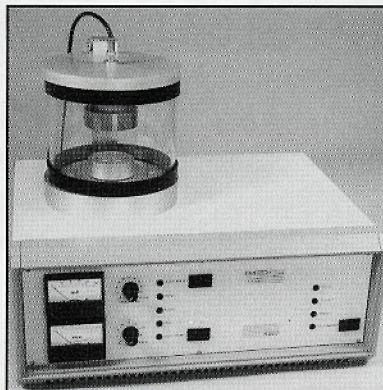
The K550 Automatic Coater