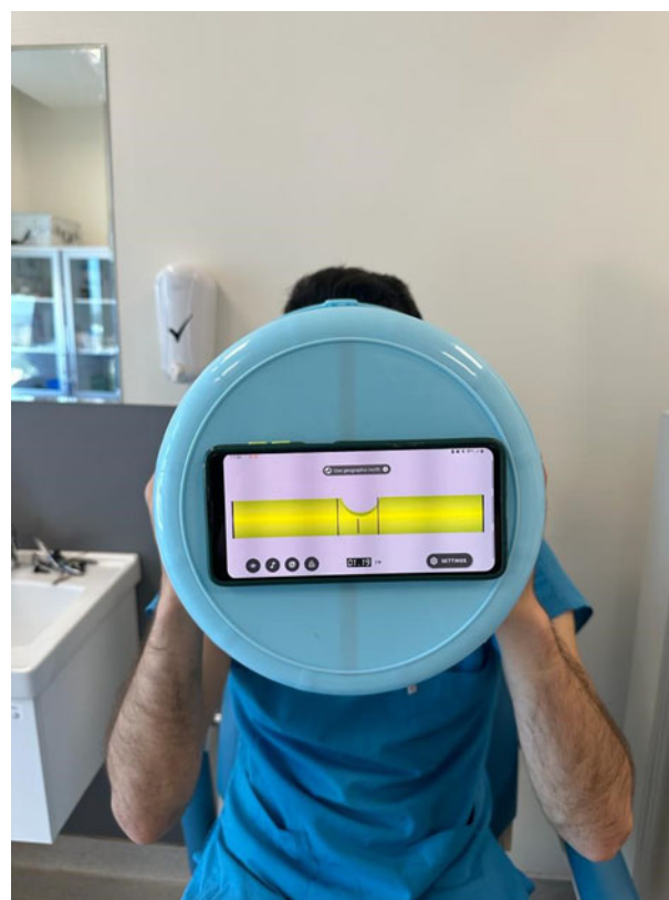
Figure 1. The smartphone-assisted modified bucket test.

Vertigo dizziness imbalance scores and subjective visual vertical deviations were compared between patients with and without BPPV using an independent sample t -test. Paired t -tests were utilised for other assessments. Statistical analyses were