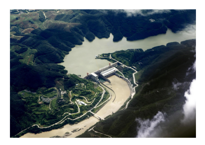
Jinghong hydropower station on the Lancang River in China

more mega-dams on the Lancang, which comprises more than half of the sediment crucial to the Mekong's ecology. The northernmost of the dams is Yunnan's 990-megawatt Wunonglong Dam high in the Himalayas of the Diqing Tibetan Autonomous Prefecture, which was completed in 2019. They continue down to Jinghong near the lush forests of Xishuangbanna. More dams are planned even closer to the Thai border at Ganlanba and Mengsong.