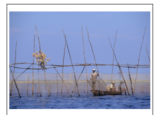
Without seasonal flooding, those who rely on the Tonle Sap fisheries face an uncertain future

The 3 million people who call the Tonle Sap region home rely on what used to be an annual US$2 billion fisheries industry, but also on the seasonal flooding that fills their rice fields. Without the seasonal flood pulse, the people of the Tonle Sap are losing the foundations of their local economy, with 2019 studies showing an 18% loss in income for those engaged in a single livelihood.