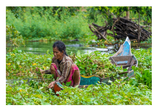
Collecting water hyacinths on Tonle Sap Lake