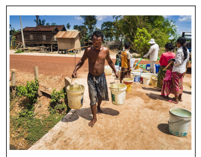
Collecting water in Sot Nikum village near Siem Reap. During the recent extreme droughts, residents relied on water supplied by NGOs or bought from sellers.

"The last 12 months have shown more symptoms of what has been predicted for the river's ecological tipping point," Eyler says. "There are those who say the present number of dams could cause the Tonle Sap's expansion to not happen. Sediment removal from sand mining in Cambodia and Laos also has an impact."