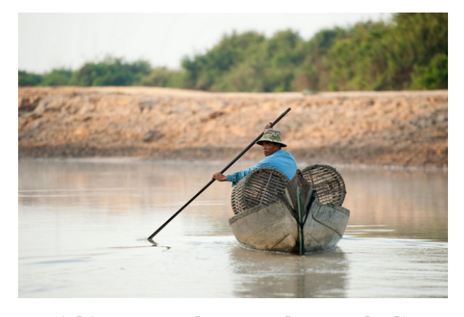
Fishing on Tonle Sap Lake, Cambodia

The Use and Construction of Dams on the Mekong will Determine the Future of Southeast Asia's Largest Lake