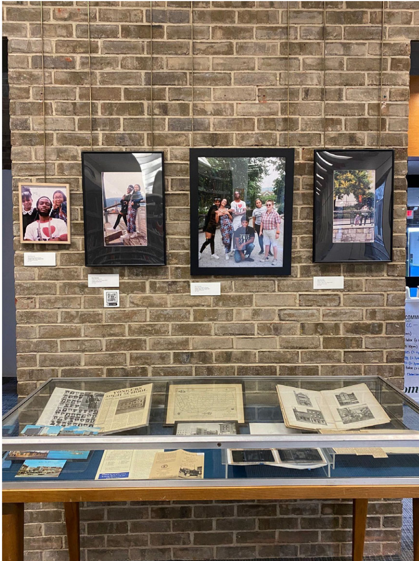
Figure 2. Pictured: Photographs from Sola's workshop accompanied by archival materials below.

revitalized an underutilized campus space, fostering connections with a community that often felt disconnected from the college environment (Figure 3).