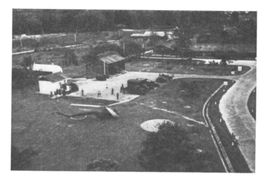
The main military hospital in the Federation A Sycamore of 194 Squadron brings in a casualty

for a further reduction in the load carried