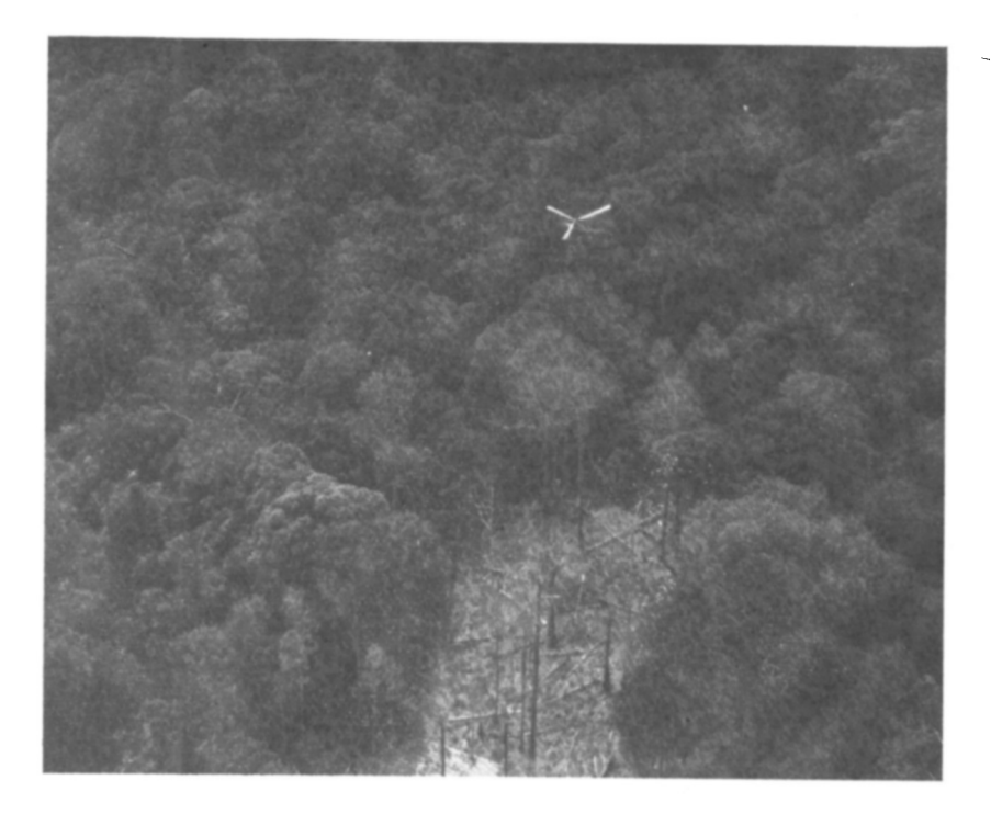
A Dragonfly of 194 Squadron drops leaflets into a typical jungle cultivation

Such wasteful flying must be avoided as much as possible and this is done by operating detachments, by making the pick-up or assembly point as near as possible to the area of operations and by substituting, wherever possible, a suitable fixed wing aircraft of the Auster/Pioneer type