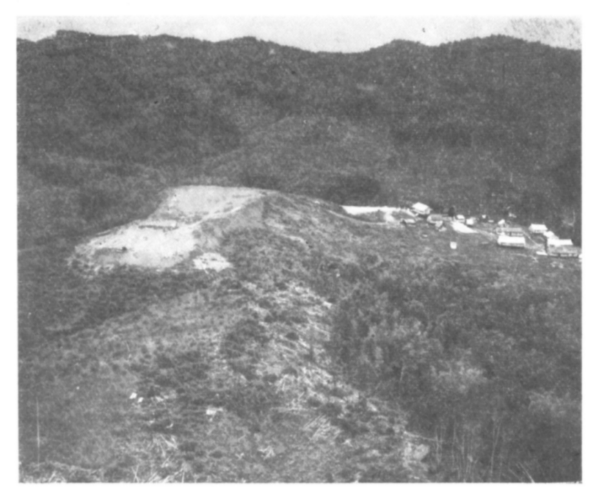
Fort Dixon, a hill top jungle fort with a PIONEER strip now constructed on the top of the hill

has been comparatively small It is the degree of tropical sickness, such as malaria which has caused a demand for helicopters for aeromedical evacua-However, to a patrol, a battle casualty or a sick man are equally tion embarrassing and without some means of relieving the patrol of their burden their sortie must be abandoned) The patrol leader immediately contacts base by W/T and requests a helicopter He than looks for and starts planning the helicopter landing area If he is in deep jungle the task of making a clearing is enormous and A O P /L L recce will most probably be called for before work starts The Auster pilot, having located the patrol, will tell them of the nearest natural clearing or the area in which a clearing could most easily be built Explosives may have to be dropped but the patrol leader informs the Auster pilot of the ETA at the natural clearing or the time he expects to have the new clearing ready Finally, when the clearing is complete a message is passed and the helicopter, which has been waiting at the nearest convenient place (usually the AOP base) takes off for the clearing, sometimes being accompanied by the Auster The casualty is picked up and is flown to the nearest British Military Hospital These hospitals have all constructed helicopter landing areas In the Dragonfly the casualty was carried in a basket, and on a stretcher in the Sycamore Casualties have been brought out from jungle forts, Police Posts and remote