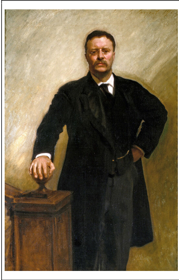
Figure 1: Presidential portrait of Theodore Roosevelt by John Singer Sargent.

Theodore Roosevelt (1858-1919) was deeply upset by the case in San Francisco. His outrage came from a curious blend of geopolitical thinking, antipathy, but also genuine respect for the Japanese people, which in the end, led him to intervene on their behalf. With this, he not only became an active proponent for a racial negotiation zone to accommodate the Japanese people, but he also came, rather oddly, to personify the idea: while he saw “whites” as representing the pinnacle of the racial hierarchy, his pragmatism, fostered by