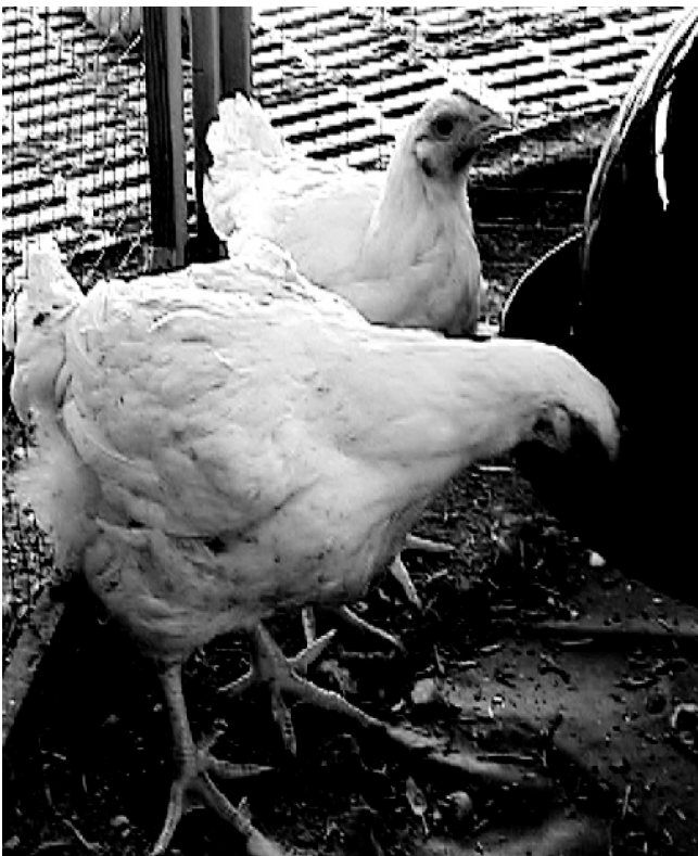
Chicken drinking from bell drinker.