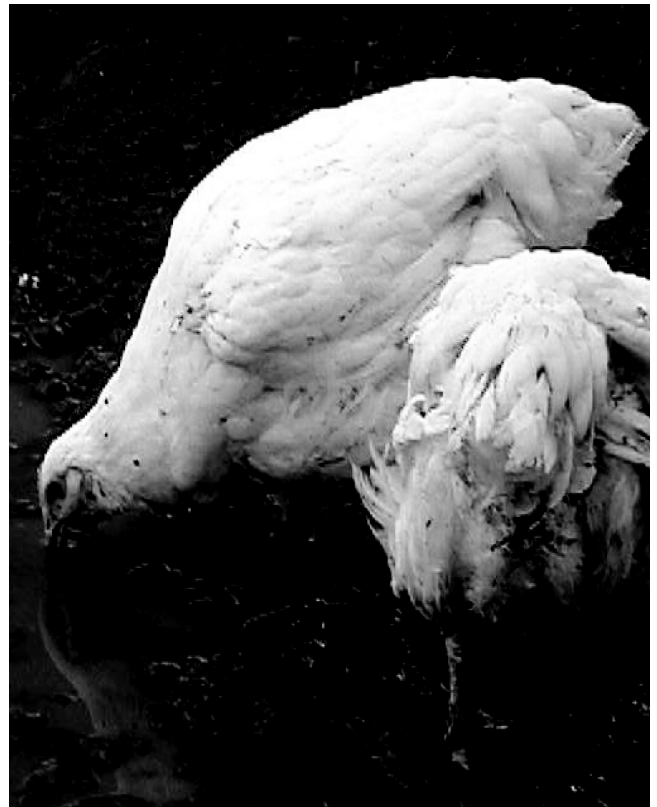
Chicken drinking from puddle.