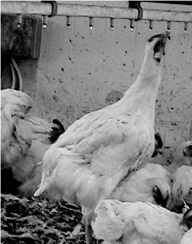
Chicken drinking from nipple drinker.