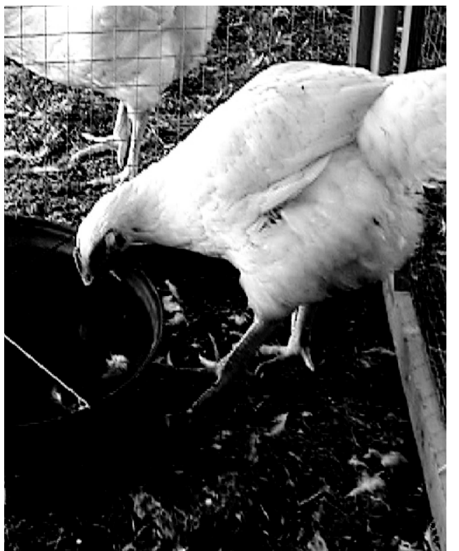
Chicken drinking from bowl.