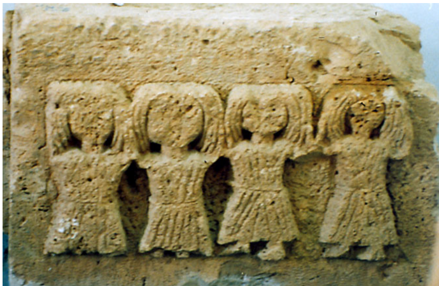
Figure 15. Bani Walid Museum. Relief illustrating four mourning women, from the mausoleum of Wadi Migdal.

four kilometres NW of Bani Walid, only the upper storey is preserved. Conspicuous portions of its figural decoration, including the prominent figure of Hercules, are still visible. The text of the inscription, written in Latin characters but in the neo-Punic language, was subjected to a brief analysis by Robert Kerr (2010): of special interest is the presence of the Latin technical loanword procurator . The second monument comes from Wadi Khanafes. Its upper storey has been reconstructed. The statue of the founder of the tomb is prominently displayed in its