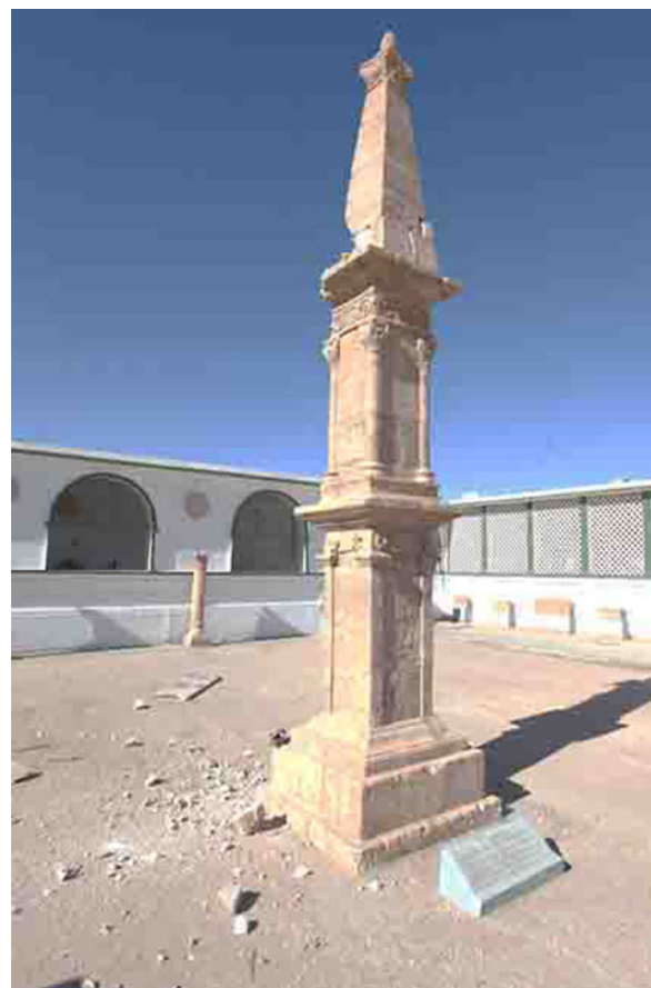
Figure 11. Bani Walid Museum, 2011.

At the moment, the collection displayed in the museum is composed of a large quantity of materials gathered throughout the Warfalla territory. Some of it, such as the elements of architectural decoration from Ghirza, the inscription from the mausoleum of Gasr Banat, the relief of mourners from the