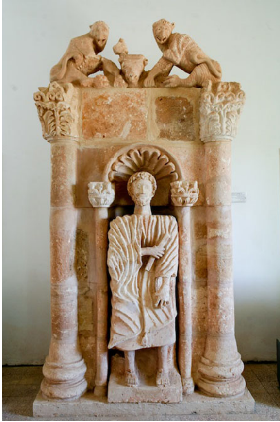
Figure 16. Bani Walid Museum. The Mausoleum of Wadi Khanafes, upper storey.

upper niche: his dress, attributes ( rotulus ), hairstyle and cut of his beard (his face is largely a modern reconstruction) are all elements that declare the patron's wish to be portrayed in the habitus of a