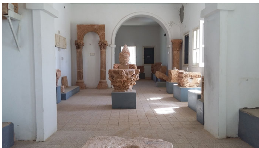
Figure 13. Bani Walid Museum, 2016, after refurbishing.

The core of the collection is composed of hundreds of architectural fragments from the many mausolea that punctuated the course of the great wadian. In some cases, they are accompanied by inscriptions with the names of the founder(s) of the tomb and his family. Other fragments consist of capitals, columns, bases, friezes, often with vegetal ornamentation, some with metope decoration, some with a continuous frieze, some with figures. Among them, we may mention some friezes from the mausoleum of Wadi al-Bneya, with decorative motifs linked to agriculture, hunting (with the use of the net), and