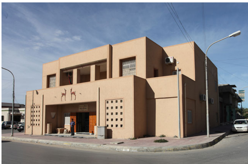
Figure 1. Zliten Museum, 2011.