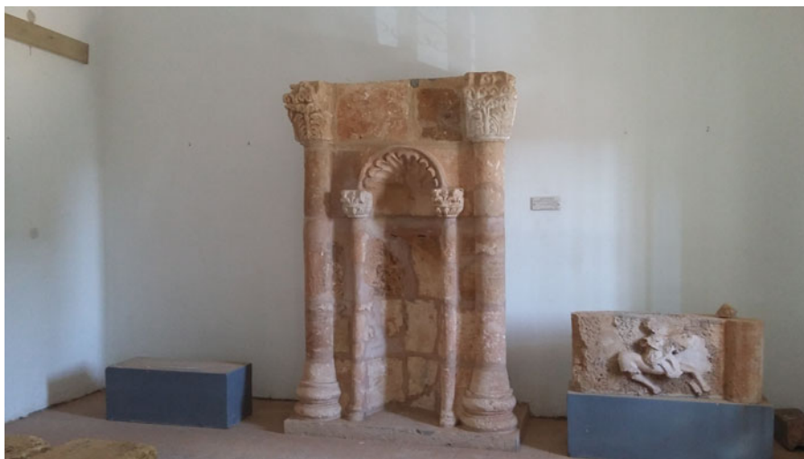
Figure 17. Bani Walid Museum. The Mausoleum of Wadi Khanafes, upper storey, present state.

The 'funerary system' has its most spectacular monumental manifestation and bears its most potent ideological message in the mausolea. They indicate considerable economic potential; they are a staging of family values; they reflect the social structure of the ruling class that commissioned them. The figurative paradigm and the codes of communication need to be further elucidated in the ongoing debate on the identity features of pre-desert culture, torn between originality, innovation and acculturation, and conditioned by the need for the families that commissioned these tombs to display their own status and power.