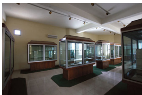
Figure 3. Lepcis Magna Museum, 2011: emptied showcases.

preserved in Italian archives and institutions, not always easy to access.