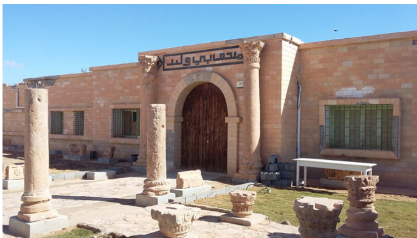
Figure 12. Bani Walid Museum, 2016, after refurbishing.

Department of Antiquities at Lepcis Magna, who transferred many unpublished items to the museum. The report and photographic documentation of the reconnaissance are of great value to identify the provenance of artefacts.