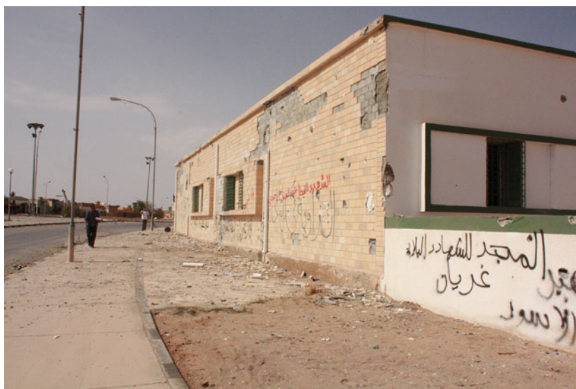
Figure 5. Bani Walid Museum, 2011.

If the years of the Jamahiriyya generally appear characterised by an atmosphere of lukewarm interest shown by the regime towards the conservation of the country’s archaeological heritage, in Bani Walid the opposite was the case. The express wish of the then president of the Department of Antiquities of Libya, Ali Emhemmed al-Khadduri, a local man and very close to the Colonel, was to create a museum at Bani Walid that would champion the values of the territory: a museum able to promote and defend the culture of the local populations, who may have been absorbed into the Roman orbit, but whose native individuality and identity are still clearly recognisable. The museum was created between 1988 and 1991. It was installed in a one-storey building originally built as a school, presumably in the second half of the last century. It consists of eleven exhibition rooms and a gallery, which surrounds three sides of the large courtyard. In 2011 the museum was the scene of gun battles between loyalist troops, who had occupied it, and rebels. Damage was caused both to the building and to the collections (Figures 6–8). The objects displayed in the glass cases suffered the worst damage: they were vandalised (Figure 9), destroyed (Figure 10), or looted (in particular coins