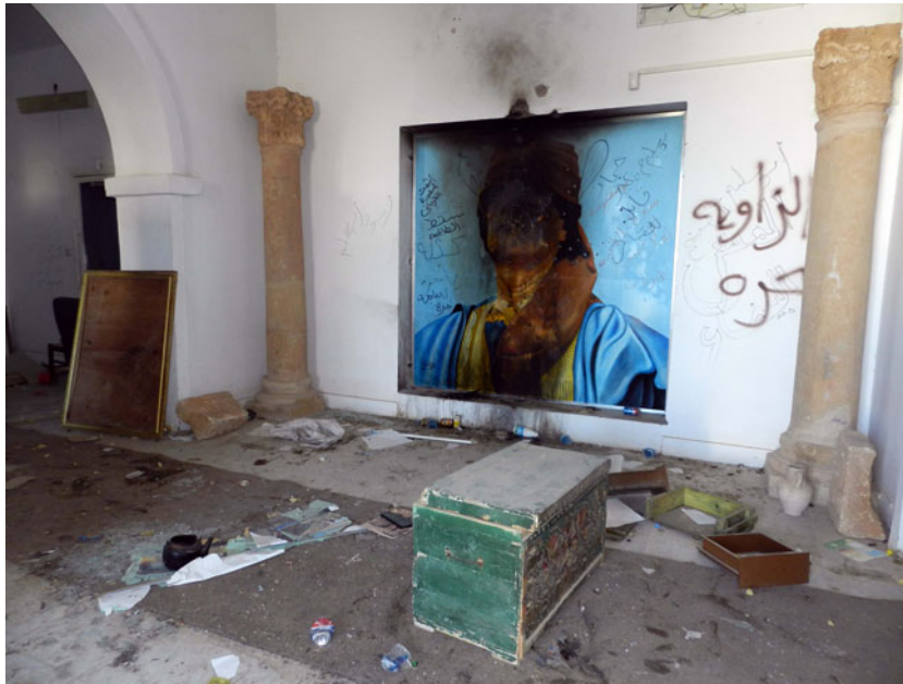
Figure 6. Bani Walid Museum, 2011.

and oil-lamps). Structural damage was caused by gunfire to the upper part of the mausoleum reconstructed at the centre of the courtyard (Figure 11). In 2016, thanks to the financial support of the community of Bani Walid, the structure has been rehabilitated and most of the artefacts restored to their original location (Figures 12–14).