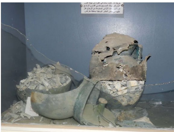
Figure 9. Bani Walid Museum, 2011.

were expressed whether I should be able to remove any one of those whom it had pleased Providence thus to punish for their sins.