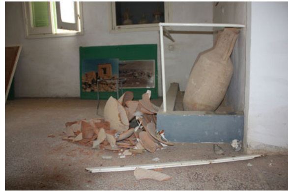
Figure 10. Bani Walid Museum, 2011.