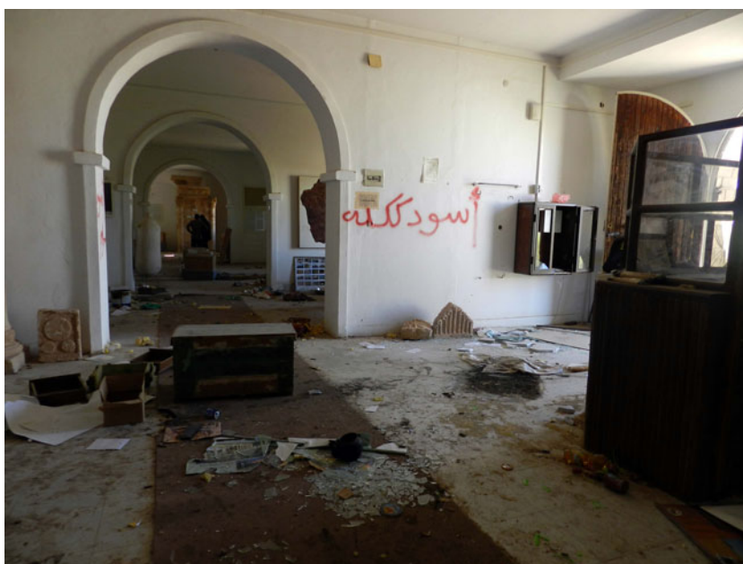
Figure 7. Bani Walid Museum, 2011.

Having found several people here who had recently arrived from the place I was bound to, I repeated my inquiries respecting the sculpture, and again received positive assurances that I should see figures of men, women, children, camels, horses, ostriches, &c., in perfect preservation; and the belief of their being petrifactions was so prevalent, that doubts