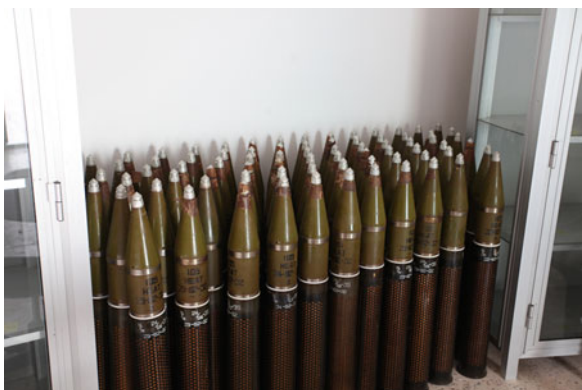
Figure 4. Madinat as-Sultan Museum: stockpiling of weapons, 2011. The exhibition room has been emptied and used as a depot for munitions.