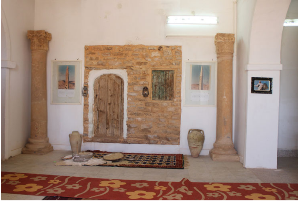
Figure 14. Bani Walid Museum, 2016, after refurbishing.

combats between men and wild animals; this latter iconography has very precise affinities with the frieze of mausoleum North B at Ghirza.