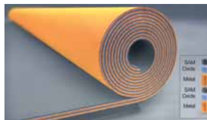
Self-rolled nanomembrane supercapacitor showing the hybrid layer sequence of self-assembled monolayer-oxide-metal. Reproduced with permission from Nano Lett. 10 (7) (2010) DOI: 10.1021/nl1010367; p. 2506.

p. 2506), the research team deposited strained multilayered nanomembranes by sequential depositions of metal and dielectric thin films on a sacrificial layer. Selective etching of the sacrificial layer initiated self-rolling of the nanomembranes into cylinders. The compactness of the cylinders was reproducibly tuned by careful control of the processing parameters. Hundreds of self-rolled cylinders can be prepared in parallel on a single chip which can be reused repeatedly. Furthermore, the research team demonstrated that organic monolayers may be introduced in the inorganic films of the nanomembranes to reduce leakage currents. In addition, these organic monolayers could be potentially leveraged for biological and chemical functionalization of these electronic elements with organic molecules. This self-rolling process can occur in aqueous media at physiological pH and is thus compatible for incorporation of biomolecules.