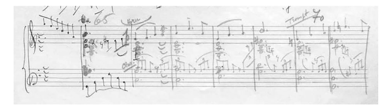
Example 3. Skalkottas, Symfonía se klassikón ýfos, bb. 64–71, p. 5.