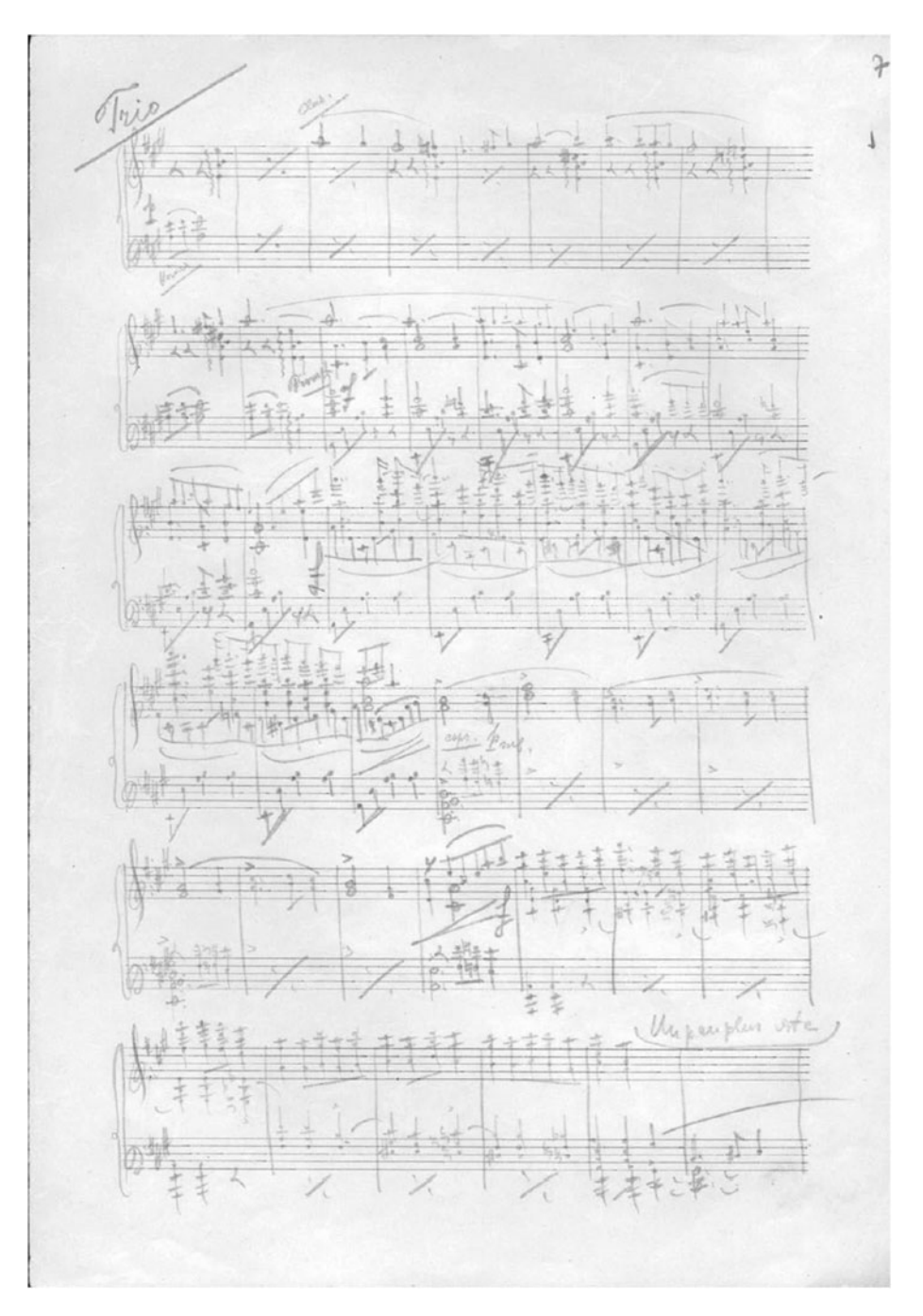
Example 5. Skalkottas, Symfonía se klassikón ýfos, bb. 1-43, p. 22.

coupled with the use of percussion in this section, emphasizes the historical aesthetic and sincerity of the work, evoking imagery of a demotic celebration (Example 6). The return of the familiar themes of the Scherzo follows in the final section. Skalkottas highlights the