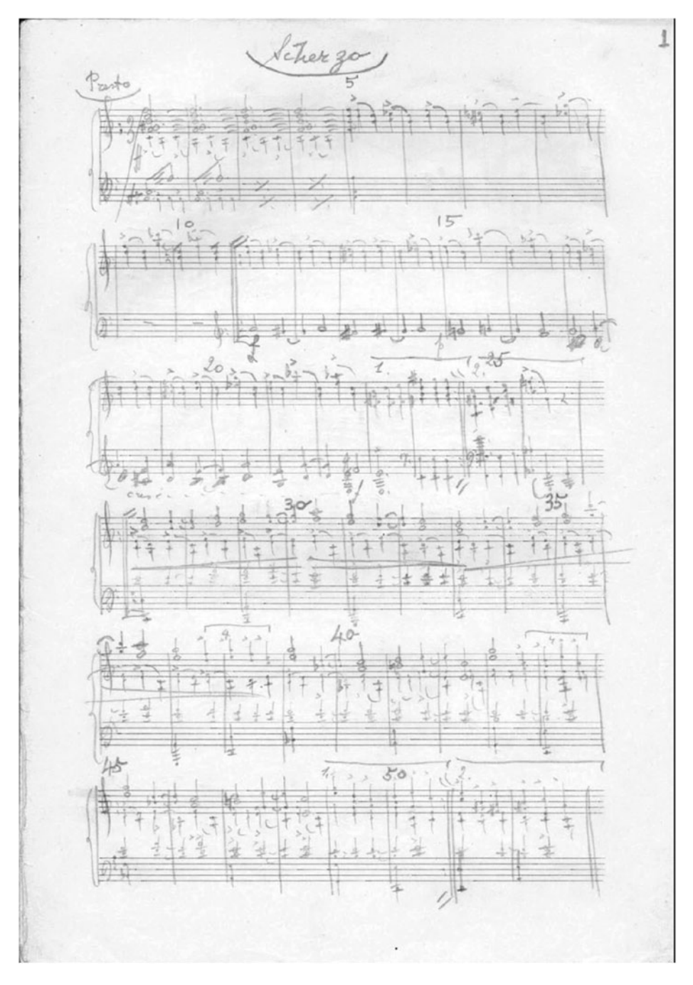
Example 4. Skalkottas, Symfonía se klassikón ýfos, bb. 1–52, p. 16.

the Scherzo, we hear a short 'sweet' pastoral theme in the tonic key (b. 47 of the Trio), accompanied by a descending parallel fifth drone. Following the fortissimo theme, this descending drone is repeated in the parallel minor. The appearance of this pastorale,