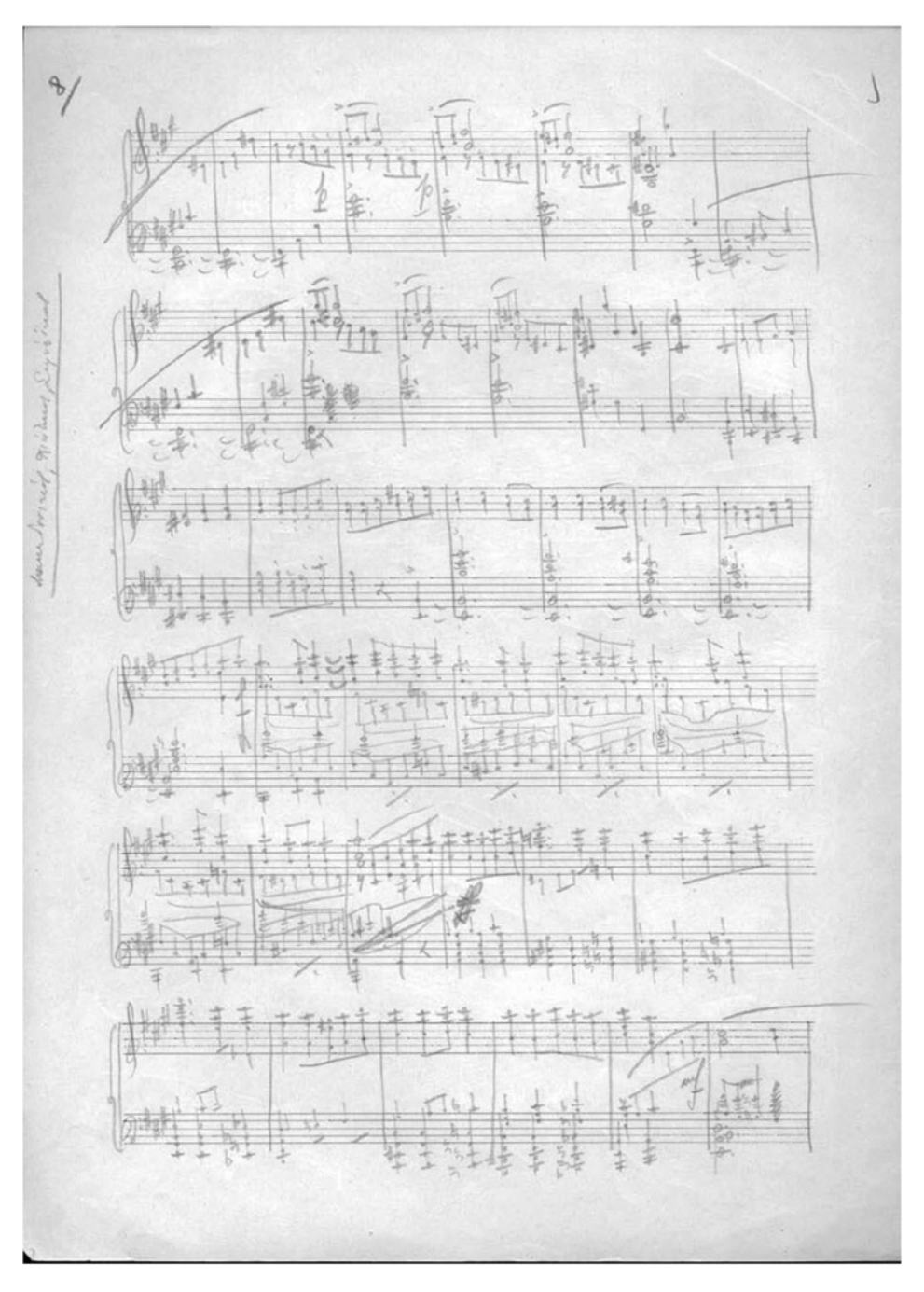
Example 6. Skalkottas, Symfonía se klassikón ýfos, bb. 44-84, p. 23.

accessibility of this section in his notes, writing that it is characterized by 'thematic and harmonic simplicity'. ^{131}