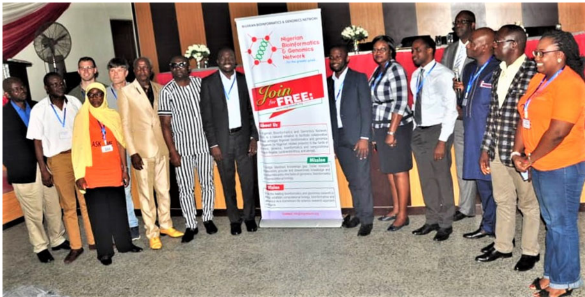
Fig. 1. NBGN inauguration ceremony. Picture of NBGN pioneer executives, keynote speakers, invited dignitaries, and some members of NBGN taken during the inauguration ceremony on Wednesday 26 June 2019.

bioinformatics and genomics investigators. NBGN aims to advance and sustain the fields of genomics and bioinformatics in Nigeria by serving as a vehicle to foster collaboration, provision of new opportunities for interactions between various interdisciplinary subfields of genomics, computational biology and bioinformatics, provide opportunities for the early career researchers.