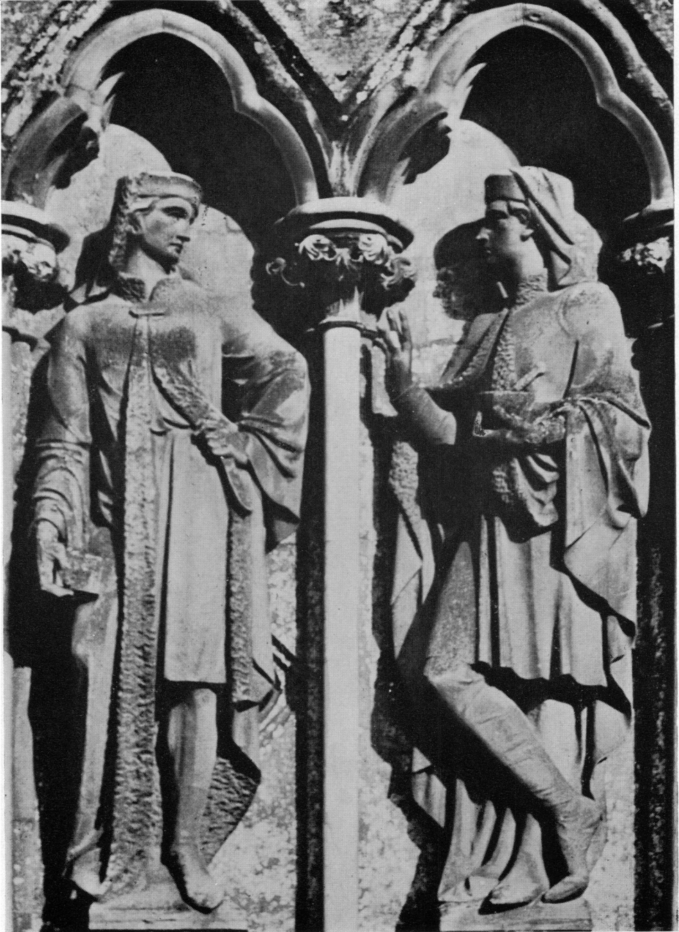
Figure 2 SS. Cosmas and Damian—statues in Salisbury Cathedral.