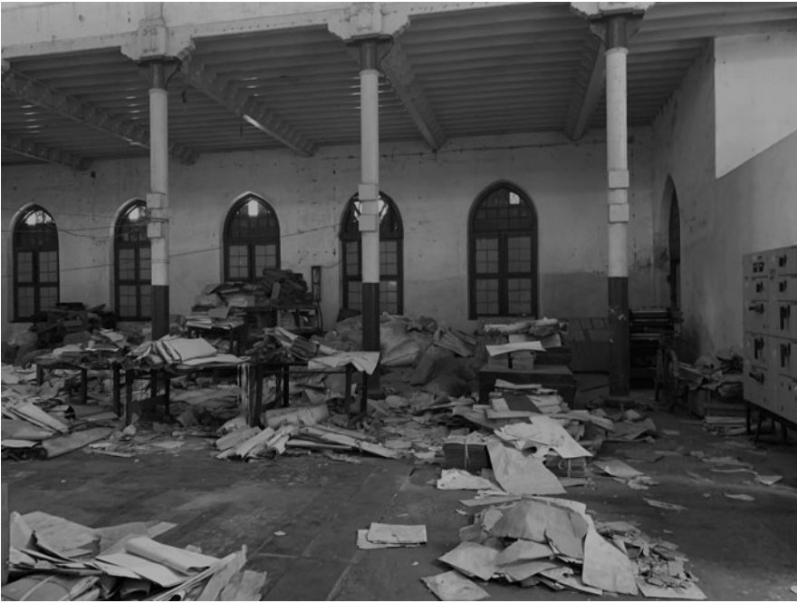
Figure 1. The neo-Palladian Persianate: interior of Chipak Palace, Madras. Built for the Arcot nawabs by the English engineer Paul Benfield in 1768, the structure stands as an early example of both British Romantic neo-classical and “Indo-Saracenic” architecture in South Asia.

anticipated the plain exposition of ‘Abdulhusain’s diary, he also complained of Indo-Persian’s excesses.