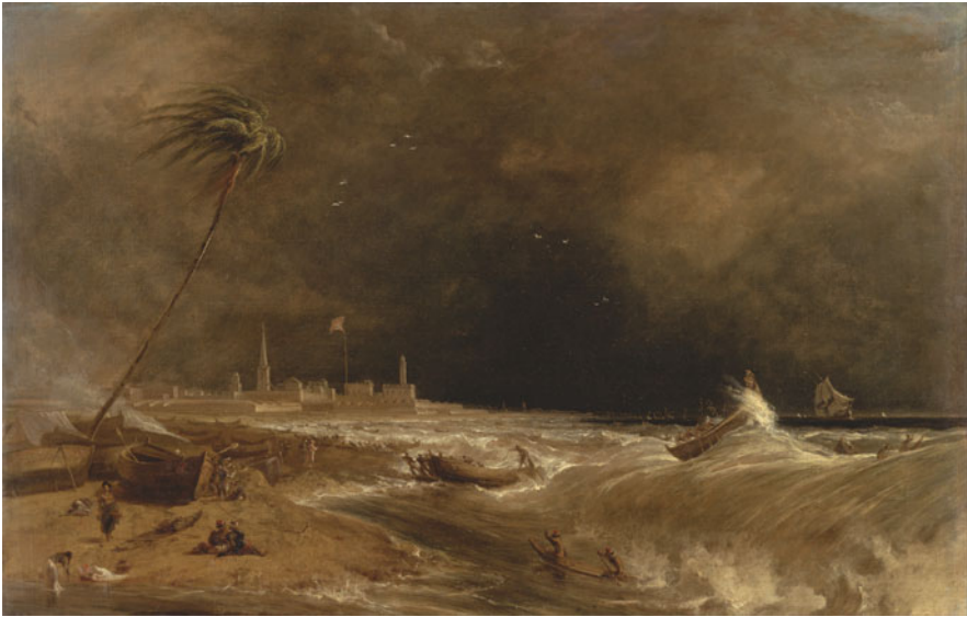
Figure 2. Madras as a beachhead of British Indian Romanticism: William Daniell's Madras, or Fort St George, in the Bay of Bengal - A Squall Passing Off (1833) captured in a colonial seascape the "awfully magnificent and sublime" views the artist had earlier also sought out in an illustrated travelogue of Britain. William Daniell, A Voyage Round Great Britain, undertaken in the summer of the Year 1818, and Commencing from Land's-End, Cornwall, with a Series of Views, Illustrative of the Character and Prominent Features of the Coast , vol. 4 (London, 1820), 36.

might have had in mind a British readership for his text, as we shall see. The plausibility of a Romantic influence becomes more tenable when considering how the prince documented the places, peoples, and polities he encountered during his travels. Again, that gesture was not new. 114 But again, it was redolent of Romanticism. Colonial paintings, prose, and poetry in this era highlighted exotic environments, archaic pasts, and savage customs as tropes of difference, to be sure. That orientalism, however, served also to intensify the quintessentially Romantic aesthetics of the "sublime" and "picturesque" (Figure 2). 115 As much as 'Abdulhusain relied on Indo-Persian ideas of climate or geography, his reflections on Arabia's atmospherics thus still came very close to British meditations on Madras's landscapes ("It is a romantic country, and every tree and mountain has some charm which attaches me to them" 116 ) and weather patterns ("We have a hot land wind, day and night, and I wish myself in one of your airy bungalows ... Your description is enough to make a plain man romantic" 117 ). "Until its ends," 'Abdulhusain wrote similarly from the Arabian interior, "the space of this country was beautiful."