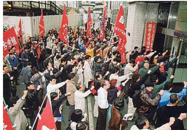
National Union of General Workers, Tokyo