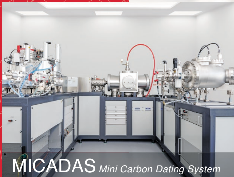
MICADAS Mini Carbon Dating System

Scientific Instruments for Radiocarbon Dating and Accelerator Mass Spectrometry