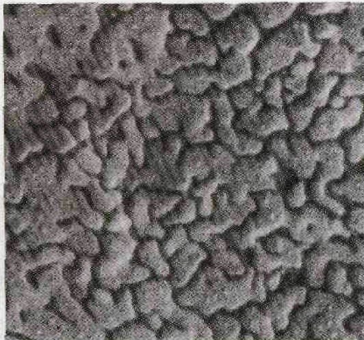
Figure 1: SE image of Au/PD film recorded At 30 eV beam energy. Field width 2 \mu m

It is difficult at low beam energies to match the electron-optical performance that can be achieved at higher voltages. This is because the brightness of any emitter varies linearly with the beam energy and so the performance of all electron sources is significantly degraded at low voltage. In addition the combination of the chromatic aberration of the probe forming lens and the energy spread of the beam produces a substantial 'skirt' around the probe which increases its diameter, spoils the resolution, and lowers the contrast in images. At the lowest energies ( i.e. , below 250 eV) the relatively large wavelength of the electrons still further worsens the resolution because of diffraction, and the depth of field of the instrument is also reduced. Despite these problems current LVSEMs, employing conventional optics can achieve resolutions of 2 nm or so at 1 keV when using a field emission gun. If retarding field optics are employed this level of performance can be maintained to