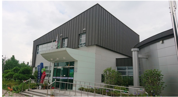
Hapcheon Atomic Bomb Museum (Photo by the author on July 21, 2019)

anti-Japan; it's anti-Abe administration."