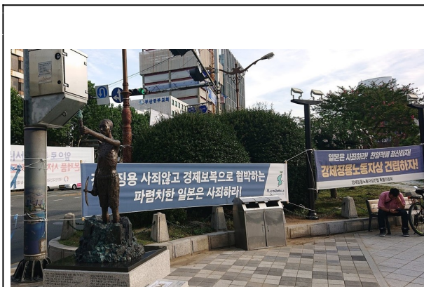
“Forced Labor” statue at a park near the Japanese consulate in Busan.

On July 22, six university students staged a protest at the Japanese consulate in Busan and were arrested, an incident that was widely reported. On a road adjacent to the Japanese consulate in Busan is a statue of a young girl erected to remember Japanese military sex slavery, and she, like the statue of a conscripted wartime laborer in a park near the consulate, faces the consulate, almost as though she is quietly watching over the events that occur there.