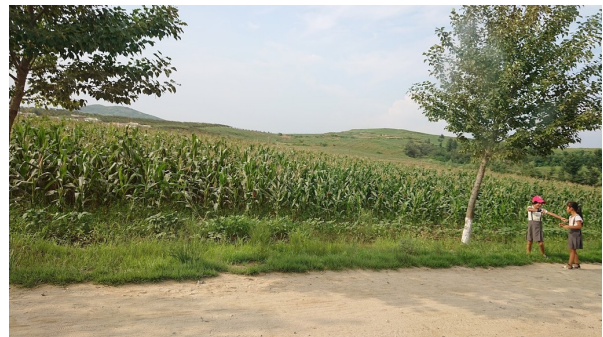
Corn fields in the countryside of DPRK

More than anything, I feel the deep-rooted hatred that Japan has for this country in the fact that while calling the southern country by its official name, the Japanese government, media, and vast majority of ordinary citizens call the DPRK not by its official name, the Democratic People's Republic of Korea, but by the epithet "Kita Chosen," a name rejected by the DPRK and many Zainichi Koreans.