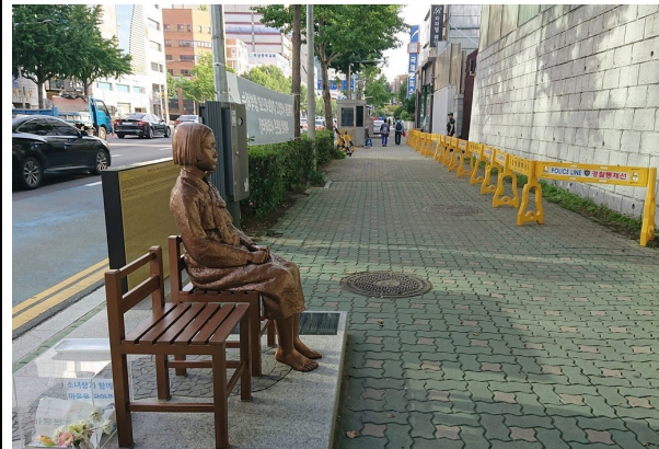
"Comfort Woman" Statue on the side street of the Japanese consulate in Busan.

In late July, when I visited Busan, the boycott against Japanese products was already in full swing and in particular nearly all the young people I spoke with there told me that they were participating. Some might criticize them, but from my perspective as someone living outside of Japan, boycotting of ROK products seems to be an already-established practice in Japan—just consider the fact that ROK automobiles, popular worldwide, cannot be seen on Japanese streets. In recent years, the ROK has always purchased far more Japanese goods than Japan has ROK goods. It appeared that the abolishment of preferential export treatment for three semiconductor materials, critical to semiconductor manufacturing, which is one of the ROK's main industries, lit a fire in