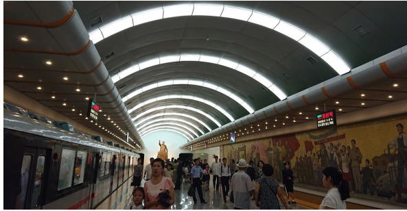
At a subway station in Pyongyang (Photo by the author on August 15, 2019)

Even now that efforts to end the war and denuclearize the Korean Peninsula have been ongoing since the Pyeongchang Olympics last year, Japan has not budged an inch in its demonization of the DPRK. This includes excluding Korean schools in Japan from the government tuition subsidy program, and even going so far as to take away souvenirs that people with roots in the DPRK bring home from their visits to the DPRK, allegedly as Japan's own unique form of economic sanction, but truly a policy that amounts to no more than harassment. There is not a shred of remorse for Japan's colonial rule, and its role in support of the United States in the Korean War and continued division.