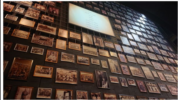
Wall to remember the victims of forced labor

The museum not only remembers the victims; it points to the perpetrators as well. At the Museum there is a list naming around 300 Japanese companies that utilized forced mobilization to grow and are still thriving today, including many major Japanese corporations such as the Mitsubishi, Mitsui and Sumitomo corporate groups. After its “liberation” following Japan’s defeat, Korea was divided in two, and more than 3 million people were killed in the Korean War that followed. The Japanese economy used this war as an opportunity for growth by means of “special procurements” whereby Japanese corporations enjoyed increased demand from the U.S. military and others involved in the war. The list of companies included the company where my father worked. Even though I have no direct responsibility for forced mobilization, I have reaped the benefits of a Japanese economy that achieved growth by trampling on the lives and dignity of the people of the Korean peninsula.