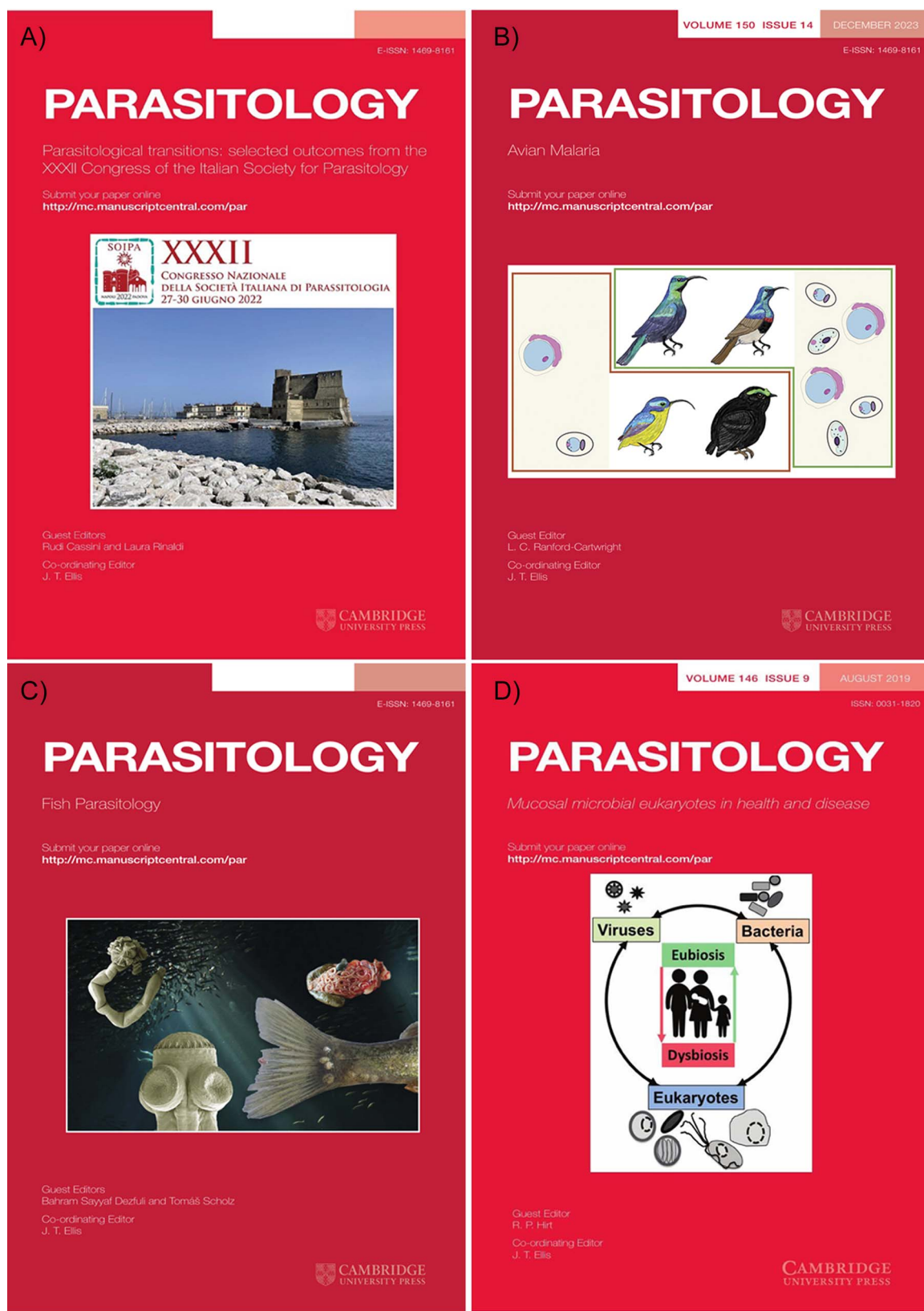
Figure 2. Front covers of four special issues: (A) XXXII congress of the Italian society for parasitology; (B) avian malaria; (C) fish parasitology; (D) mucosal microbial eukaryotes in health and disease.