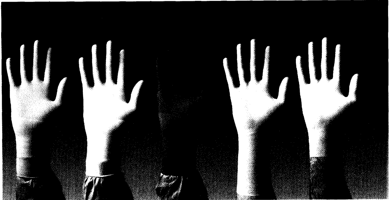
NEUTRALON® Brown Latex Surgical Glove MICRO-TOUCH® Latex Surgical Glove MAXXUS® Orthopaedic Latex Surgical Glove MICRO-TOUCH® XP Latex Medical Glove MICRO-TOUCH® Latex Medical Glove

Protection. The key to our superior glove line.