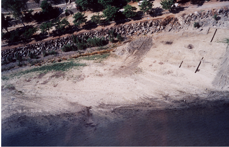
Figure 2 Aerial photo of Ohalo II camp during excavations, looking west. The dark oval areas between the narrow trenches are floors of in situ Late Pleistocene brush huts. Sediments at bottom left are post-occupation. Water level is about -213 m.