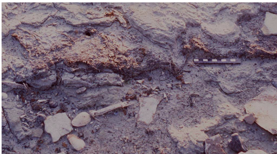
Figure 6 A close-up view of in-situ organic matter in lacustrine sediments at Tel Katsir Beach. Scale bar is 10 cm.

trend. Each water level rise deposited a low-energy cover over the abandoned camp. Thus, the site reflects a time of short water level fluctuations around the -213 m level, and then a high stand long enough to deeply cover the area by additional sediments. Such a rise is evident in the finely laminated layers covering both Ohalo II and Ohalo II South. This event is dated to about 19,500 BP.