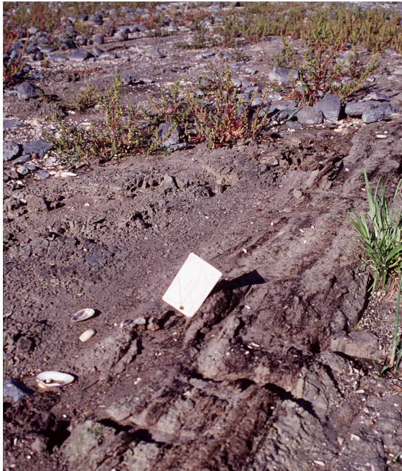
Figure 5 A close-up view of in-situ organic matter in steeply dipping lacustrine sediments near the Salix tree trunks looking northeast (Beit Yerah southern Beach)