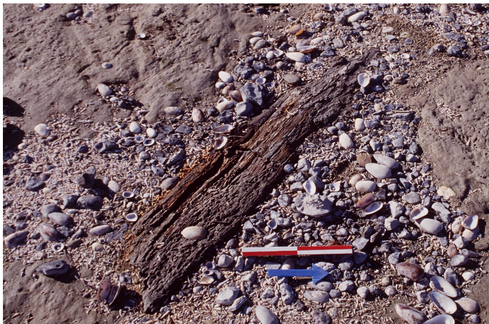
Figure 4 A Salix trunk embedded in Late Pleistocene clay sediments at Beit Yerah Southern Beach. Scale bar is 20 cm..

would probably have decomposed before the later ones would have been deposited. Thus, the facts that they are concentrated (and not visible elsewhere on the beach) and excellently preserved reflect one short depositional episode followed by an immediate water level rise. It is also noteworthy that the trunks do not look like the remains of natural bank vegetation. The absence of other tree parts and other species, and the presence of a gazelle horn core and isolated bones might indicate human intervention here. This can only be tested in future excavations (water levels permitting).