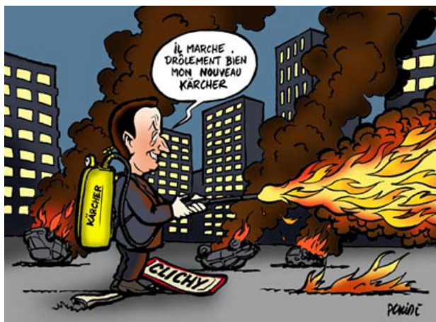
Cartoonist depicts Sarkozy's 2005 plan to clean up the

In 2005, while Sarkozy was minister of the interior, his comment about "social trash" triggered riots in suburban Paris. It is based on an extremely nihilistic view--which also suits his philosophy to strengthen supremacy--that it is inevitable that an economically liberal society produces social dropouts and a powerful mechanism is needed to "clean up" such "trash" that opposes the establishment.