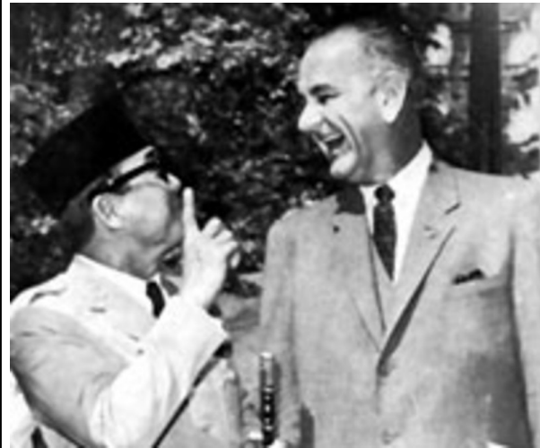
Presidents Johnson and Sukarno, Washington DC, January 1965.

According to Bradley Simpson, the United States government also provided the Indonesian Armed Forces with covert monetary assistance, small arms from Thailand, and communications equipment. 10