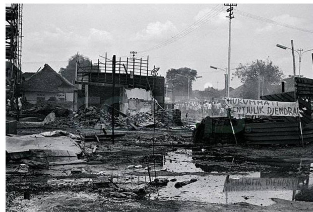
Public burning of hammer and sickle. PKI headquarters burned, 8 October 1965.

The support was not merely rhetorical. In July 1965, two months before the coup, and at a time when Congress thought it had terminated U.S. aid to Indonesia, Rockwell-Standard secured a contractual agreement to deliver two hundred light aircraft to the Indonesian Army in the next two months. 9