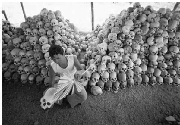
Skulls from the massacre with a relative of one of the victims.

This cultural bias becomes encoded in our own brains, and more importantly in the brains of those who govern us and the world. Our leaders assume, like the British before them, that American actions are “clearly directed to others’ benefit.... Where others push their national interest, the U.S. tries to advance universal principles.” 13