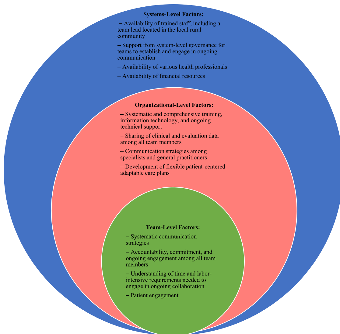
Figure 2: Adapted socio-ecological model depicting factors influencing team-based PHC