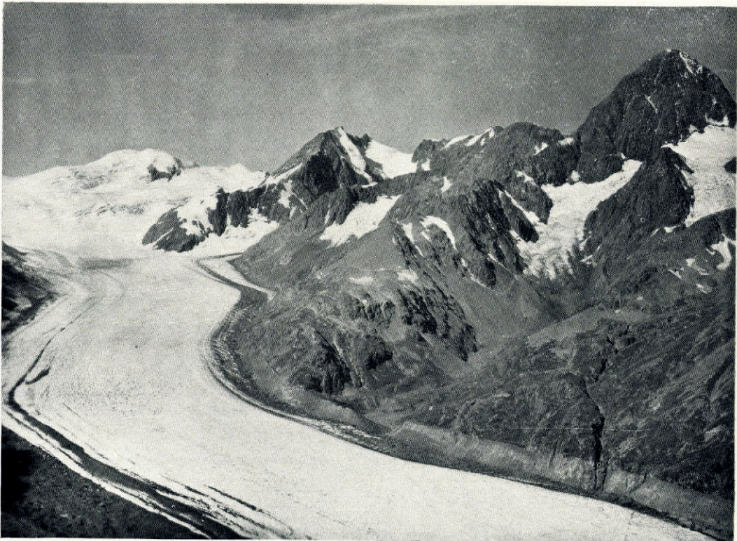
Fig. 1. (See text, p. 142) Tasman Glacier and Malte Brun Range, Southern Alps, New Zealand. The "vegetation line," with which remnants of a lateral moraine of the same age and approximately the same height are associated, is parallel to the present glacier surface for twenty-two km. from the terminal face. The greater part of the down-wasting however occurred later in the upper part of the glacier than in the lower part