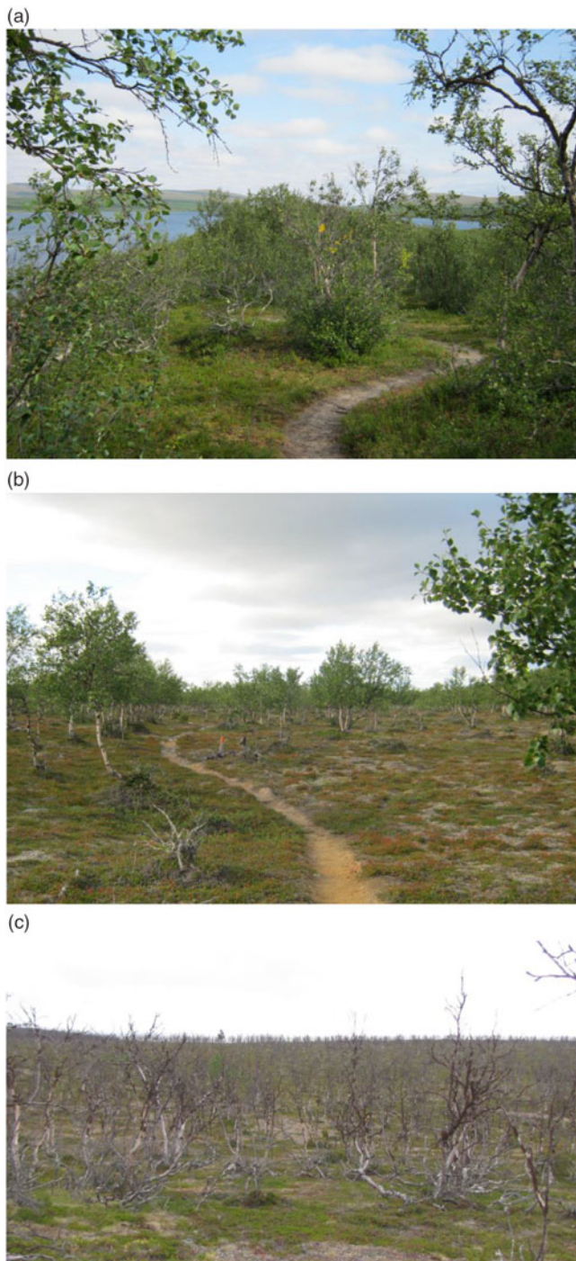
Fig. 2. Mountain birch forest before an autumnal moth outbreak without (a) and with (b) intensive reindeer herbivory, and after the outbreak (c).

since childhood, and reflected in local practices (Forbes, 2006; Helander-Renvall, 2014; Vuojala-Magga, Turunen, Ryyppö, & Tennberg, 2011).