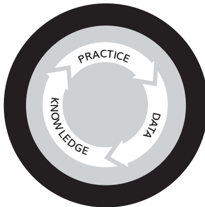
Figure 1 The data-knowledge-practice learning cycle

Using data collected during routine care for learning system purposes is not straightforward. Because the data is generated as a by-product of care provision, it is not always high quality. If collected data is inaccurate, incomplete, or out of date, then the knowledge generated may have the same problems, which could result in poor decisions and possibly harm to patients. 21 Improving data quality requires a multi-level, sociotechnical effort from patients and staff, clinical coders, system designers, and analysts, ideally supported by some higher-level oversight. For example, in the NHS, the automated Data Quality Maturity Index (DQMI) 22 is used to assess the quality of data submitted by providers. DQMI results are published and fed back to data providers to drive improvements. However, the DQMI cannot detect some important aspects of data quality, such as inaccurate data flowing from a provider. Catching such errors currently depends on analyst's contextual knowledge of the dataset, the