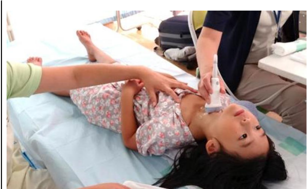
A thyroid test

On 9 October 2011, Fukushima Medical University (FMU) started a two-stage programme of thyroid cancer tests for 368,000 residents in Fukushima Prefecture who were aged 18 or under on 11 March 2011. The first stage was the 'Preliminary Baseline Survey' and began on residents in 'high exposure areas' and eventually covered all municipalities. The original plan had been to commence three years after the incident, but the testing was brought forward due to parental concerns. 1 In April 2014, FMU started the second stage 'Full Scale Survey' of 380,000 residents, now including those who were in utero on 11 March 2011. Participants are to be tested once every two years until they are 20 years old, and then every 5 years for the rest of their lives. The programme uses advanced ultrasound equipment and is unprecedented in scale. It is part of a wider Health Management Survey aimed at estimating the exposure levels and assessing the health status of all Fukushima residents, approximately 2 million people. The first case of thyroid cancer was reported on 12 September 2012 after 80,000 children had been tested. 2 Since then, the numbers have risen steadily. As of writing, 56 have been diagnosed with thyroid cancer, 1 with a benign tumour, and a further 47 are suspected of having the cancer. This brings the probable total to 103 out of 296,026 eligible residents examined. 3 Thus far, nearly all initially 'suspected' cancers have later been confirmed as malignant.