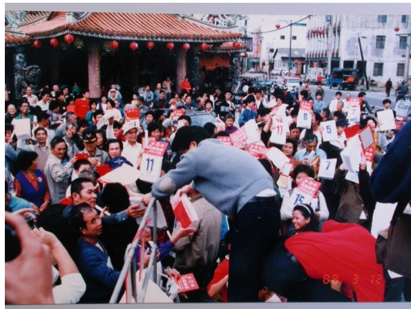
YASA collecting Taipower calendars, March 1988, by Liao Ming-hsiung, collected by Wu Wen-tung

The event was remembered as their "declaration of war" against the state's nuclear power policy. 21