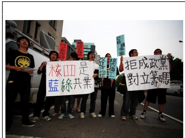
Anti-nuclear Demonstration, March 2011

about the hazard of nuclear power. Living on an island that also sits in a seismic area, the Taiwanese strongly related Japan's disaster to their own concerns for the safety of nuclear power. "What if the Fukushima nuclear disaster occurred in Taiwan" became a question that kept haunting the imagination of the Taiwanese. On 9 March 2013, over 220,000 people throughout the island marched in the streets protesting the government's development of nuclear energy in the largest anti-nuclear demonstration in Taiwan. 84 Yet the Fukushima Incident only changed people's perception on what to protest, not how to do it.